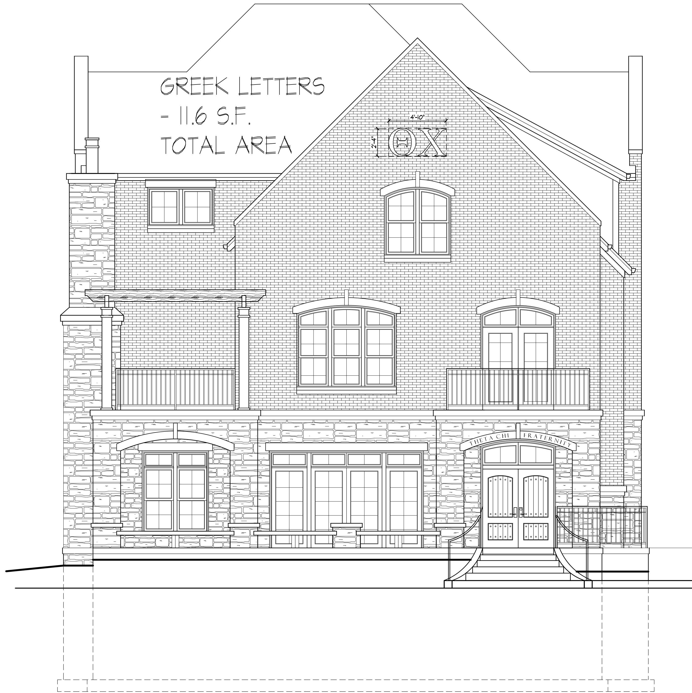
LANGDON ST. ELEVATION 1/4" = 1'-0"