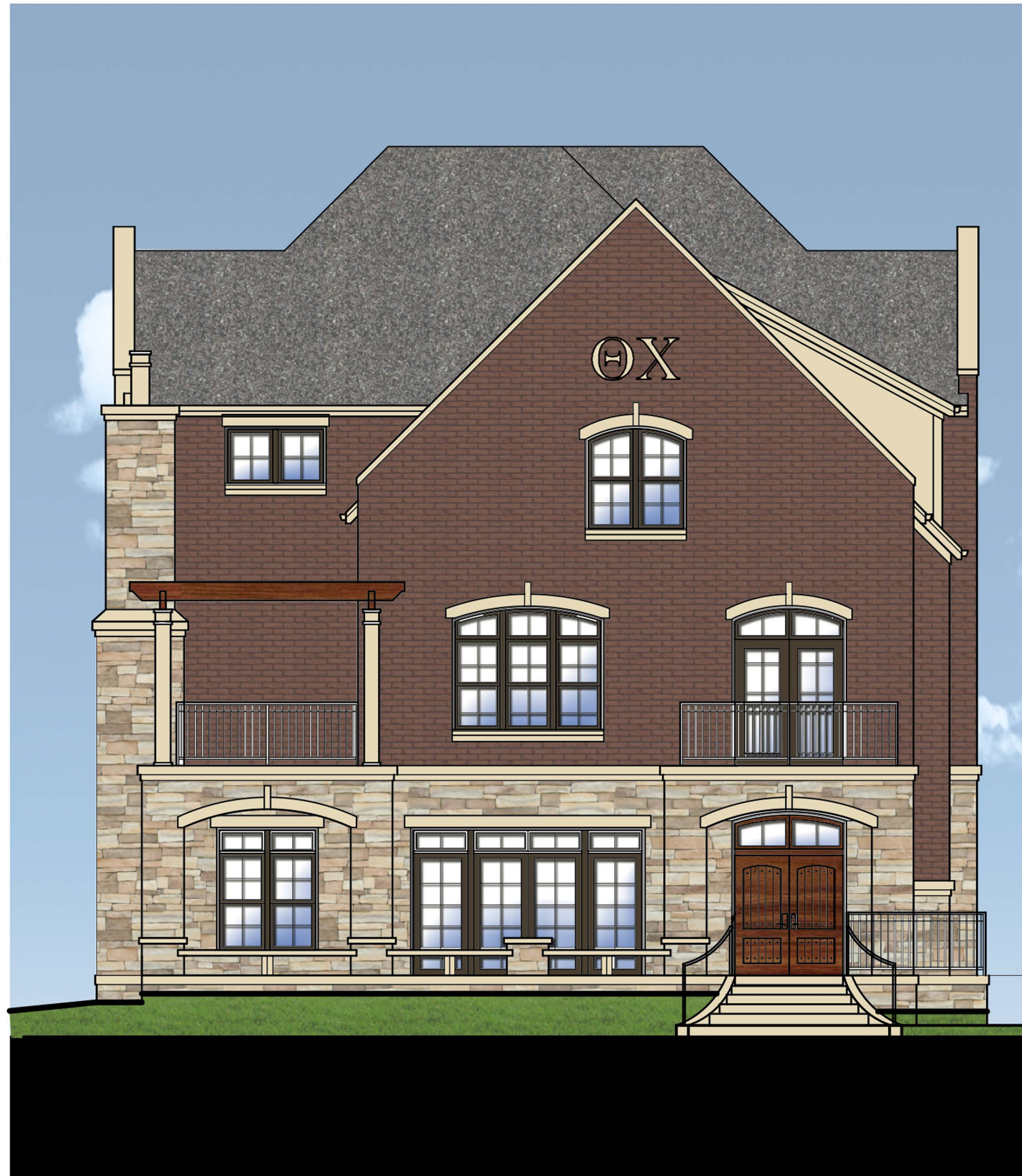
○ LANGDON ST. ELEVATION 1/8" = 1'-0"

This document contains confidential or proprietary information of Knothe & Bruce Architects. Neither the document nor the information herein is to be reproduced, distributed, used, or disclosed, either in whole or in part, except as specifically authorized by Knothe & Bruce Architects. Knothe & Bruce Architects is a Limited Liability Company of Wisconsin.