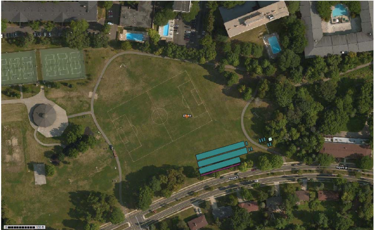
Rennebohm Park Option for Discussion - SE Corner 3