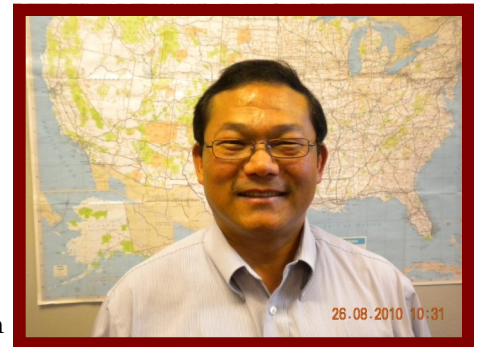
Fuechou Thao Fluoride Supplement Program Administrator

When used appropriately, fluoride is a safe and effective agent that can be used to prevent and control dental caries. Fluoride is needed regularly throughout life to protect teeth against tooth decay. Our goal is to reduce the incidence of dental caries in children throughout Dane County by assuring that a sufficient amount of fluoride is accessible to everyone. Water fluoridation is the number one preventive advantage in reducing dental decay.