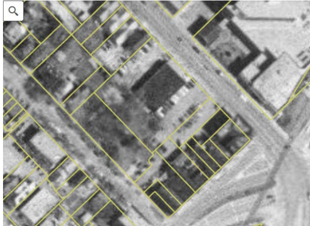
1995 Aerial (DCIMAP):