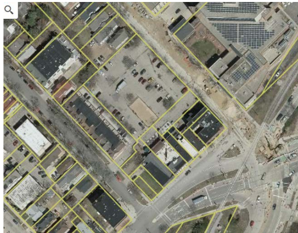
Existing Conditions (DCIMAP):