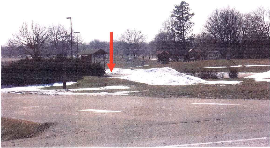
Approaching church driveway. Proposed location of sign is indicated by arrow on the right side of the driveway.