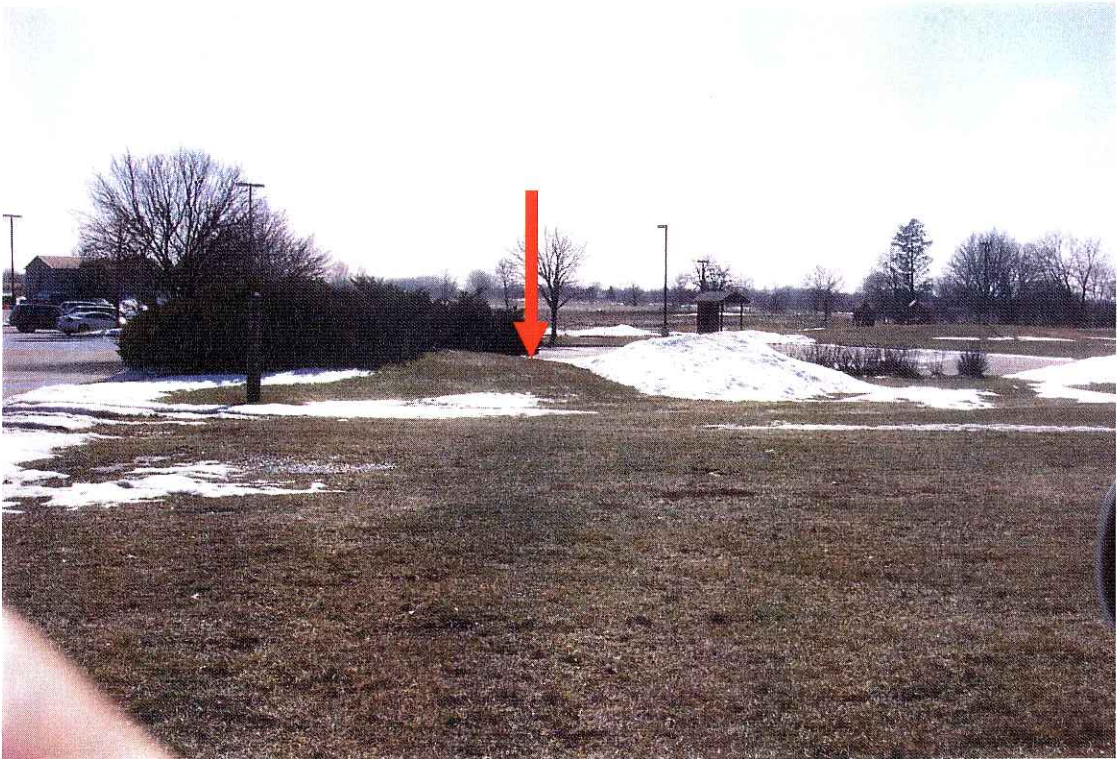
Driveway view of sign. Arrow indicates location.