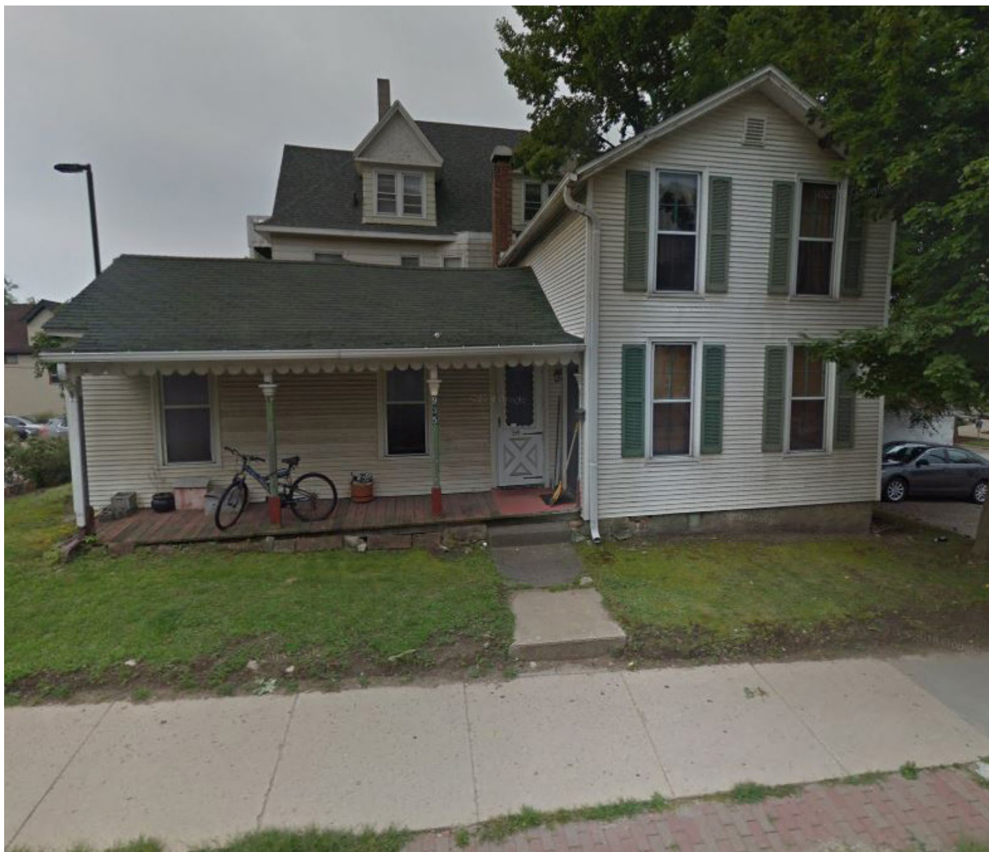
935 W. Johnson Street

935 E. JOHNSON STREET REZONE University of Wisconsin-Madison Facilities Planning & Management P:\SHARE\Master Plan Update 2015\Zoning Approvals\CI Master Plan\CI-Amendments\935 W.Johnson