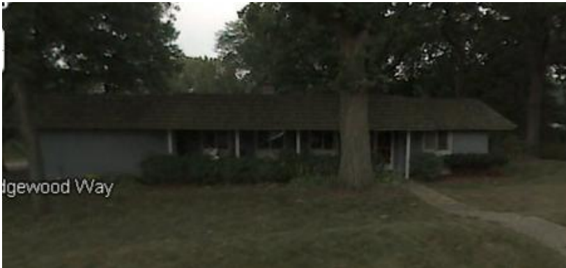
Google street view image