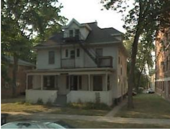
Google street view image