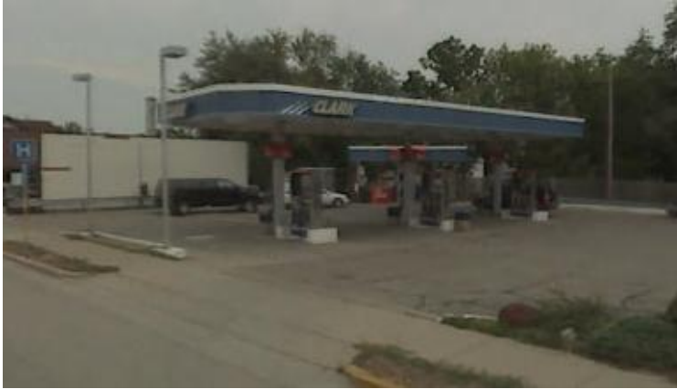
Google street view image

Commercial building, date of construction unknown