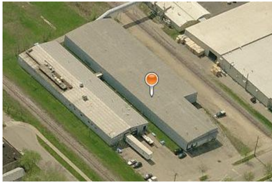
Bing aerial view image

Commercial building, date of construction unknown