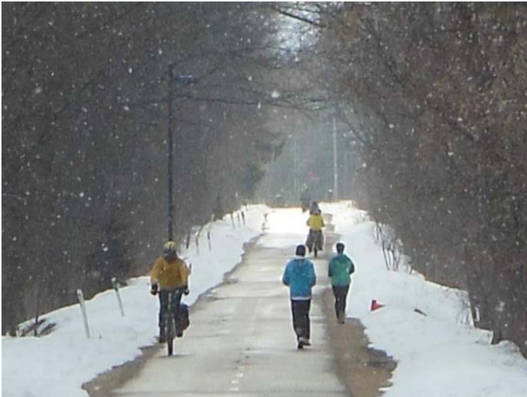
Figure 4: This is a photograph of the existing Southwest Path. The Tenney Park path will be widened from 8-feet to 10-feet to increase comfort and to make the path more stable for use by maintenance vehicles. Two light poles, like those shown in the photo are proposed to illuminate a dark section of the path between Dickinson Street and Marston Avenue.