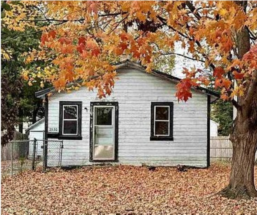
View from Zillow.com