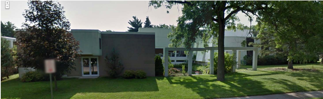
Google street view