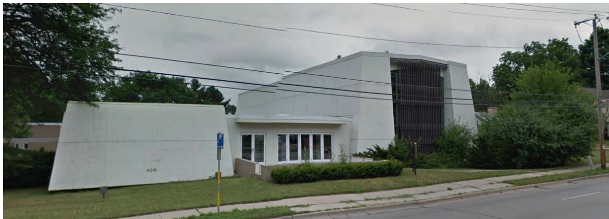
Google street view