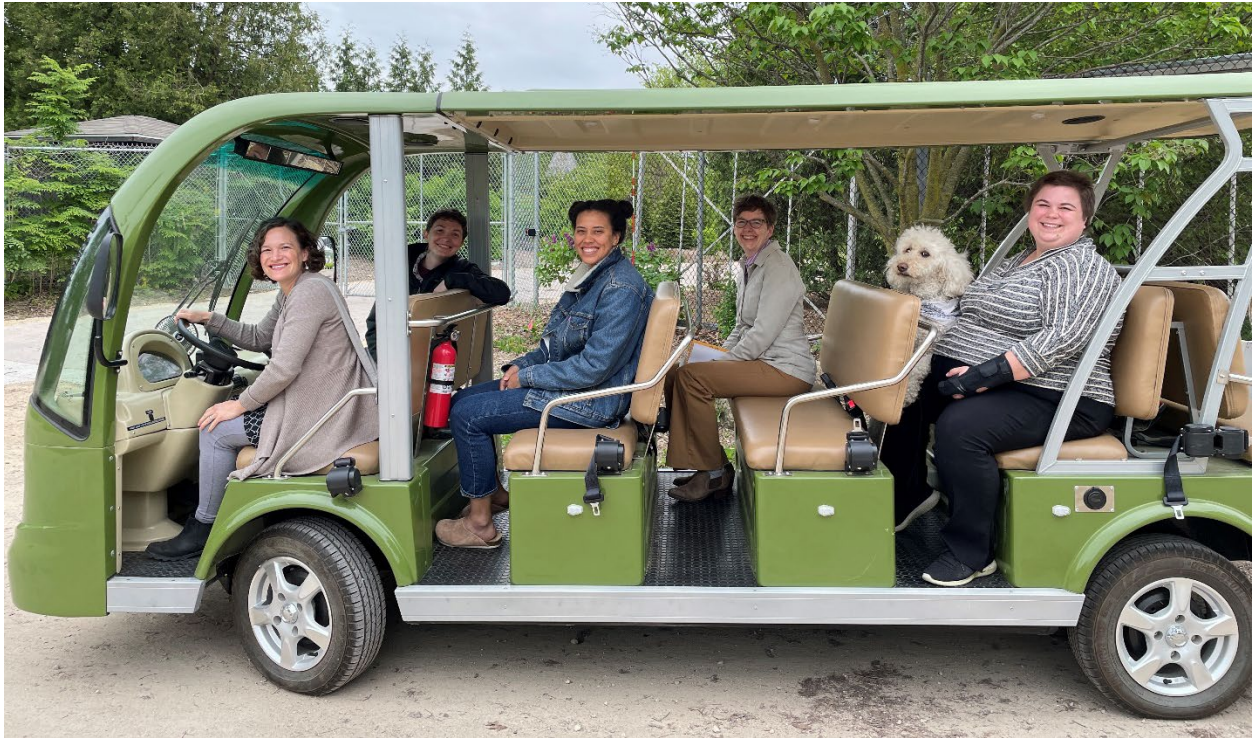
Figure 2: Education staff conducts a tram trial run

For the first time since the pandemic started, the Olbrich tram is up and running again. Guests to the gardens may enjoy a narrated tour of the gardens. The recorded tour was updated this spring and now features the Horticulture staff talking about the specific gardens they manage. There is no cost to ride the tram, but donations are welcomed. The tram runs daily from 10am-4:30pm for the summer season.