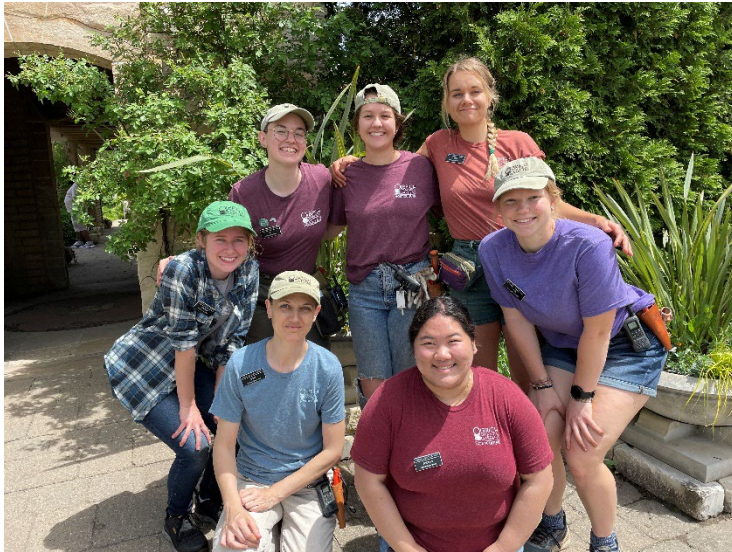
Figure 4: Horticulture Interns 2022

This summer Olbrich welcomed 7 interns to the Horticulture Department and 1 intern to the Education Department. New this year is a partnership with Madison College who provided two students to Olbrich for summer internships. Horticulture interns work alongside staff and volunteers in the gardens. The education intern is supporting summer programming and is engaging guests in various activities at the new Discovery Cart. The cart was beautifully crafted by Reflo , Arts @ Large , and Milwaukee high school interns. It came equipped with tons of materials and resources for nature-based, outdoor programs for youth. OBS purchased the cart with funds from a donor who wanted to support educational programming.