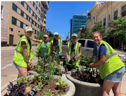
Figure 3: Olbrich interns and horticulture staff plant containers on State St.

Once again, Olbrich horticulture staff and interns beautified State Street. They created colorful planters and baskets all along State Street.