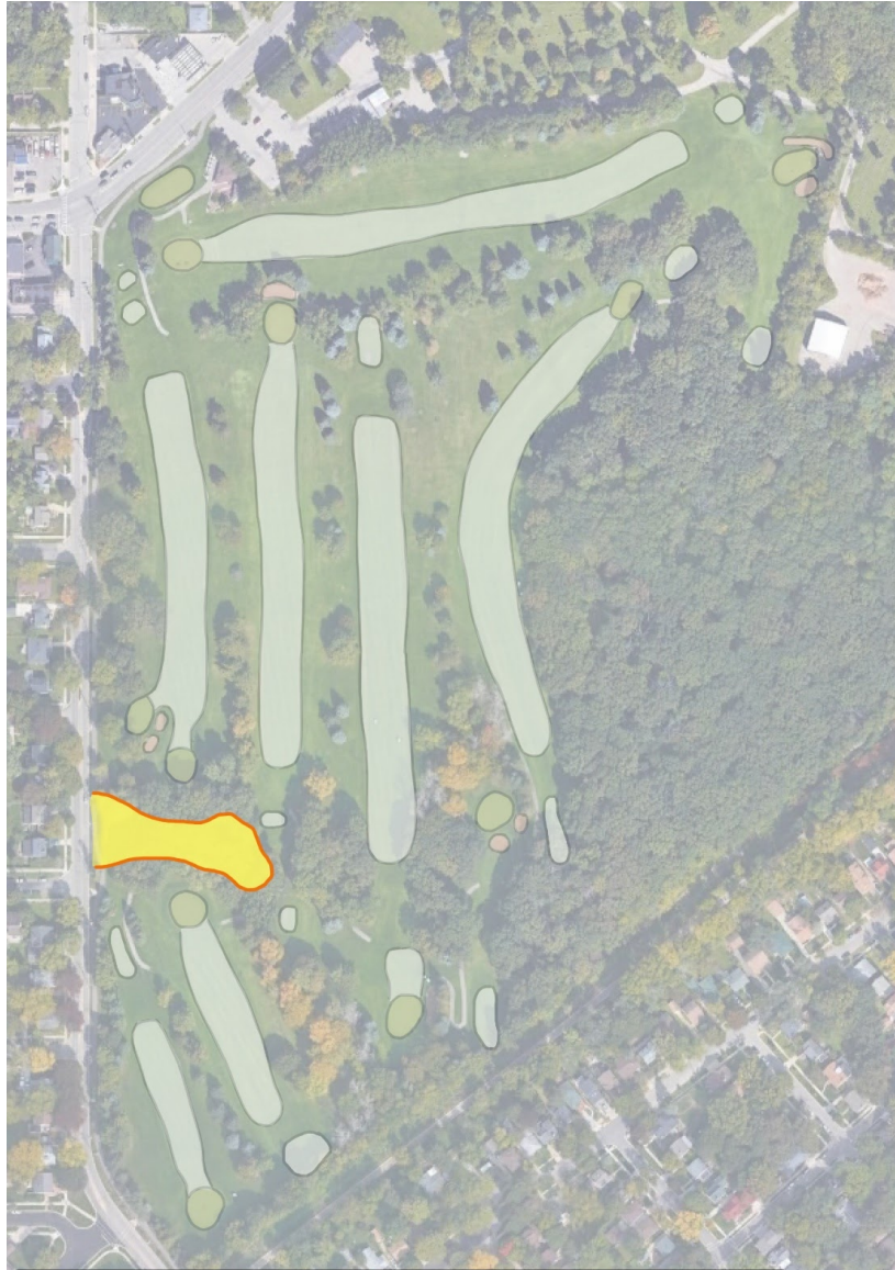
Current Natural Area