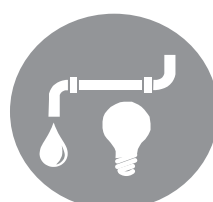
Utilities & Community Facilities