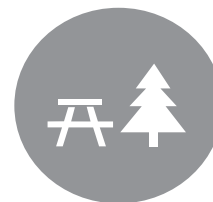
Parks, Open Space, and Recreation