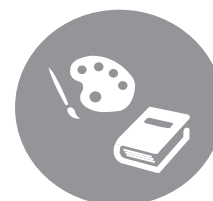
Cultural and Historical Resources