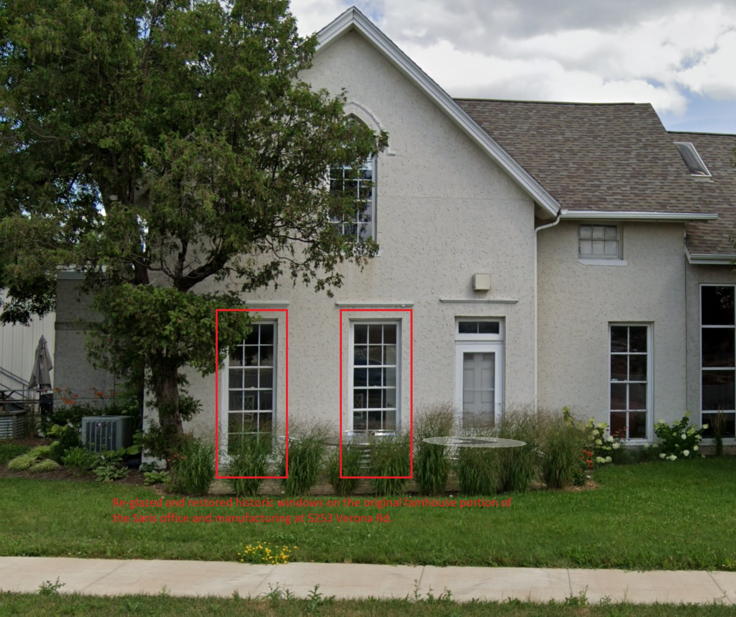
Re-glazed and restored historic windows on the original farmhouse portion of the Saris office and manufacturing at 5253 Verona Rd.