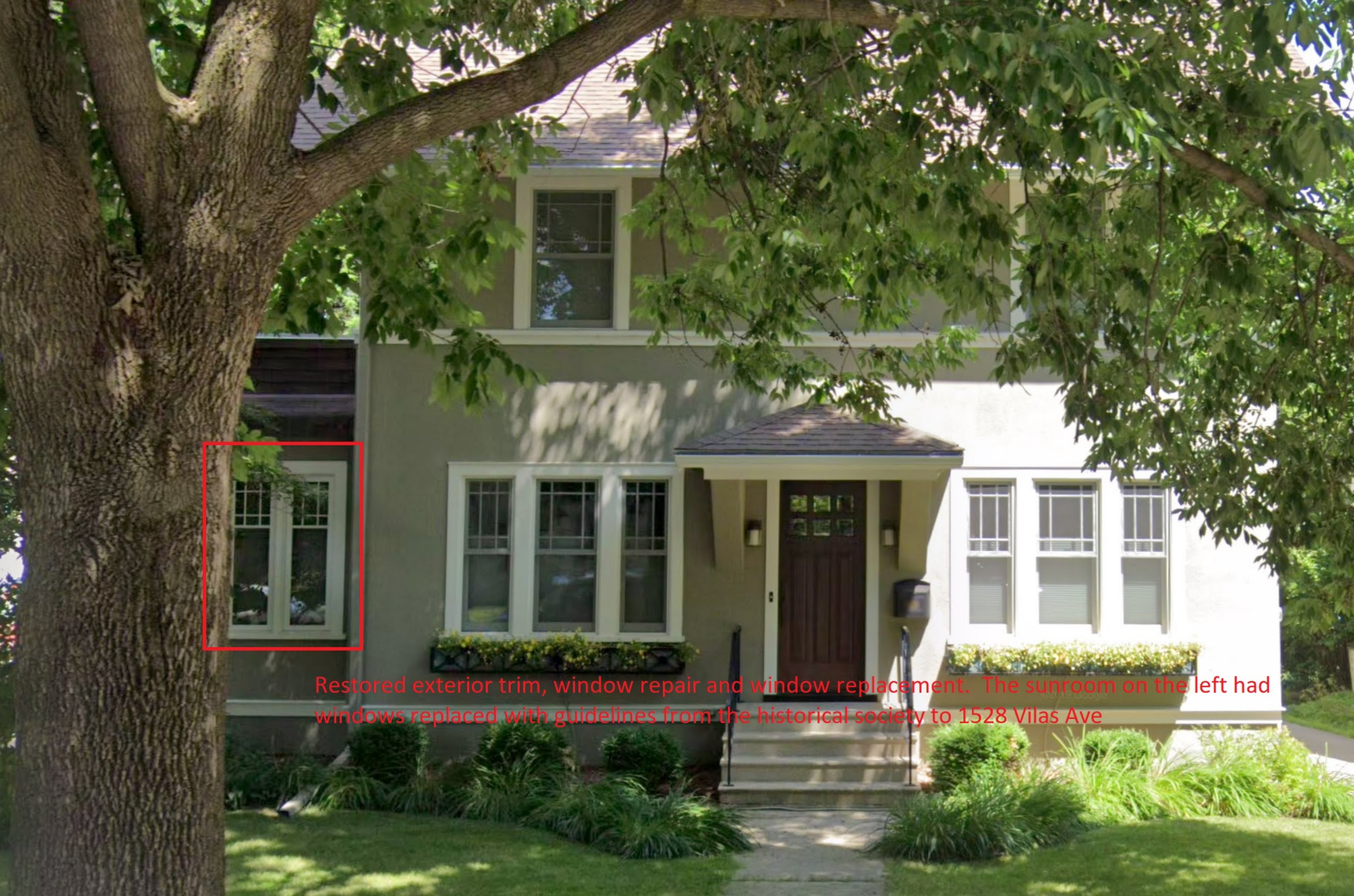
Restored exterior trim, window repair and window replacement. The sunroom on the left had windows replaced with guidelines from the historical society to 1528 Vilas Ave