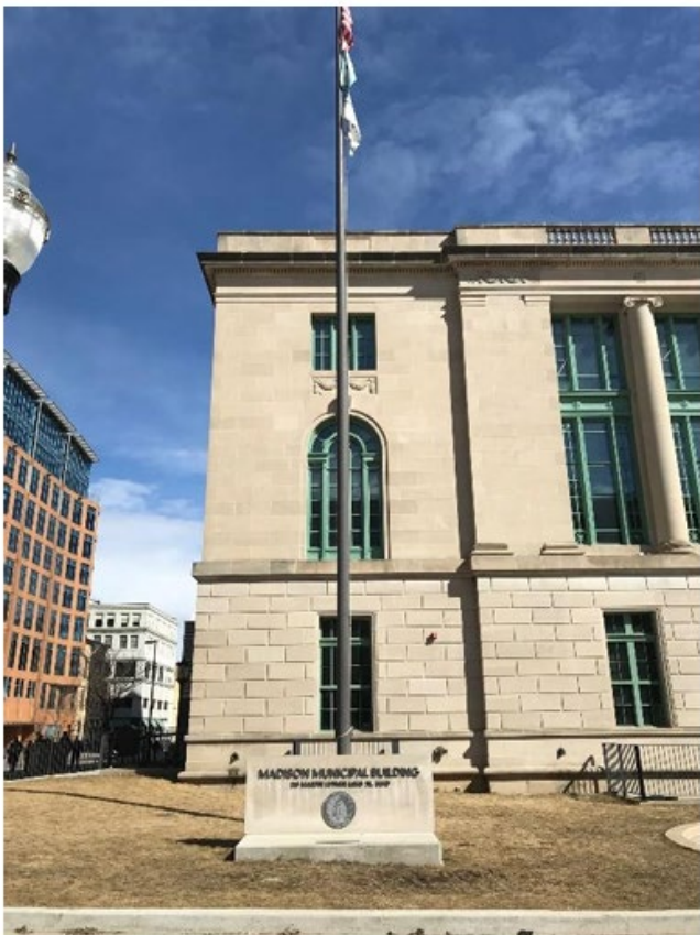
Figure 1: Existing Flagpole