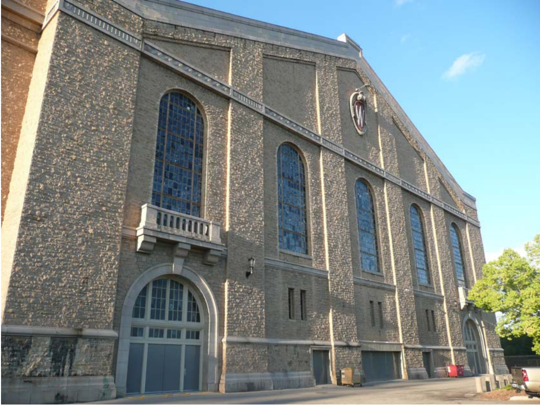
UW Field House: Main facade looking north