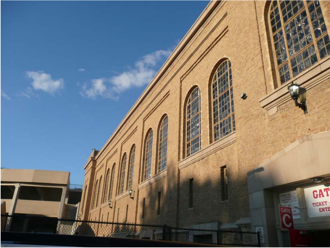
UW Field House: West elevation