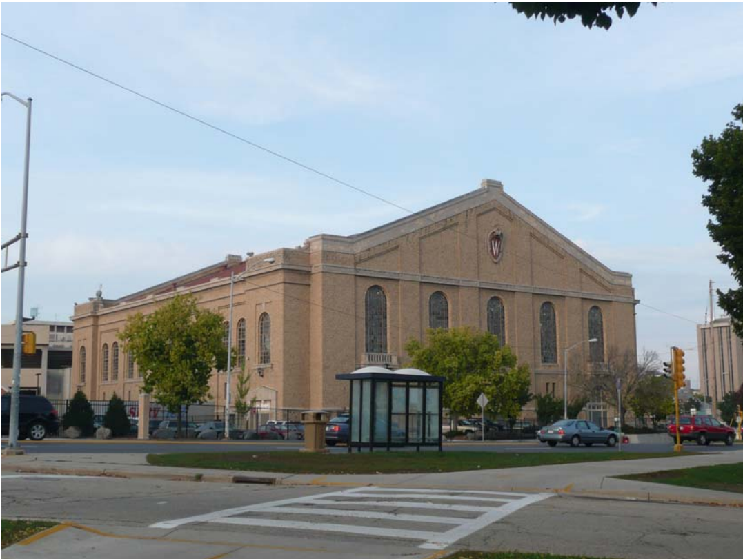
UW Field House: Main facade and West elevation