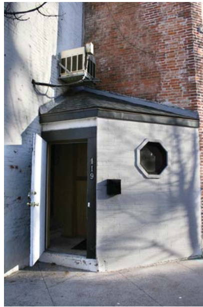
Exterior: Entry to apartment on N Fairchild Street