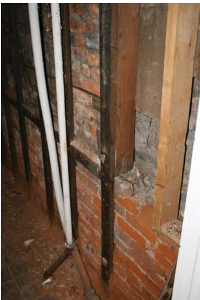
First Floor Retail