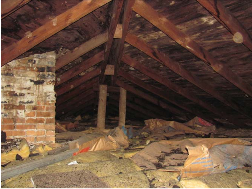
Figure 9. View of the roof framing from the attic.