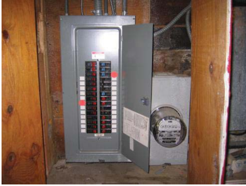
Part of the electrical service in a constructed cabinet.