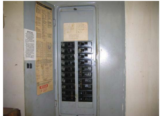
Electrical panel in 127 State Street (First Floor).