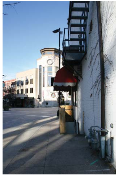
Exterior: View of basement access, gas meter and fire escape within the public right-of-way