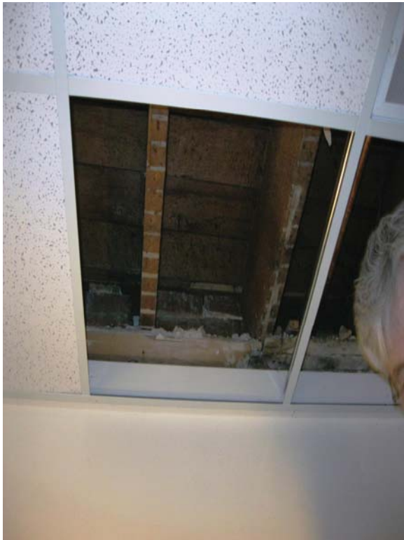
Photo 12 – 2 nd floor joist framing observed from 1 st floor retail space