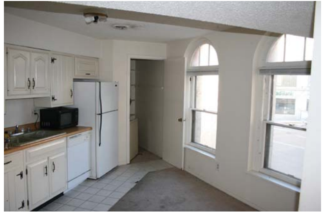
Second Floor Apartment: Kitchen