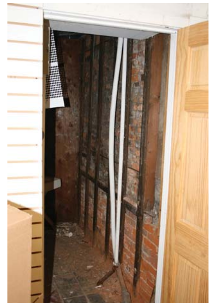
First Floor Retail