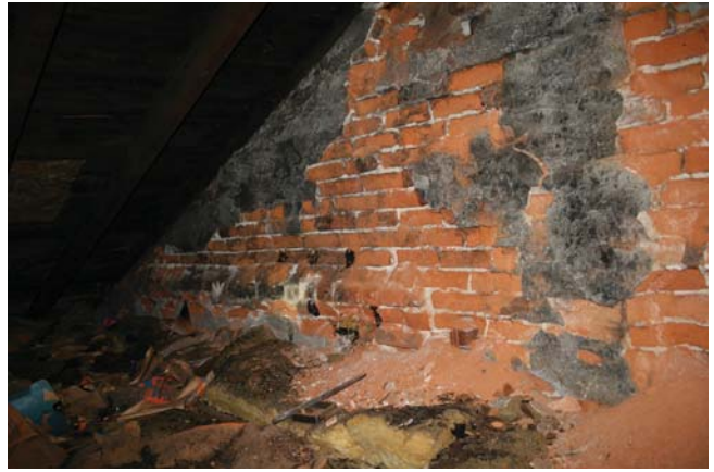
Attic: View toward wall between 127-129 state street and the castle and doyle building showing significant damage to existing brick