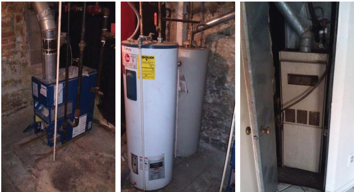
Boilers, water heaters, and furnace

The heating system consists of an atmospheric hot water boiler in the basement, which provides heat for the first floor retail spaces. Three functional domestic water heaters are also contained in the basement that serves the retail spaces and the apartment. Two are electric and one is natural gas-fired. The apartment is heated and cooled by a gas-fired furnace within the apartment. The condensing unit is supported on the side of the building along Fairchild Street adjacent to the second floor fire escape. The corner (vacant) retail space is heated with a hot water unit heater and cooled with a window air conditioner. A second retail space (Vic's Popcorn) is heated and cooled with a furnace and the condensing unit is wall hung above the N. Fairchild apartment entrance.