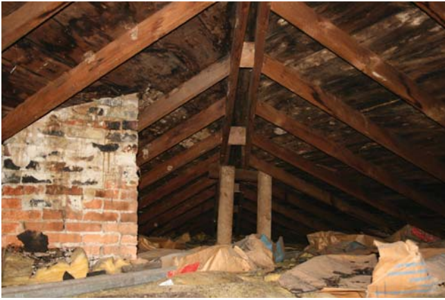
Attic: View toward flat iron corner showing damage to chimney