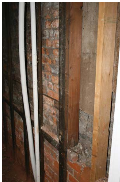
First Floor Retail