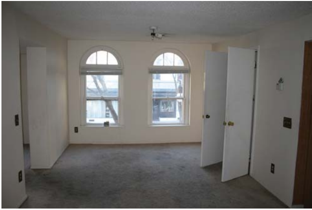
Second Floor Apartment: Living Room