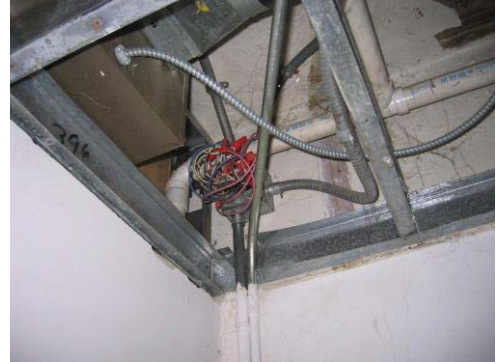
Wiring in 129 State Street.