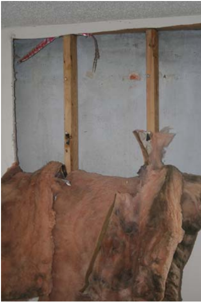
Third Floor: Section of exterior wall exposed showing back of brick and moisture within the insulation space