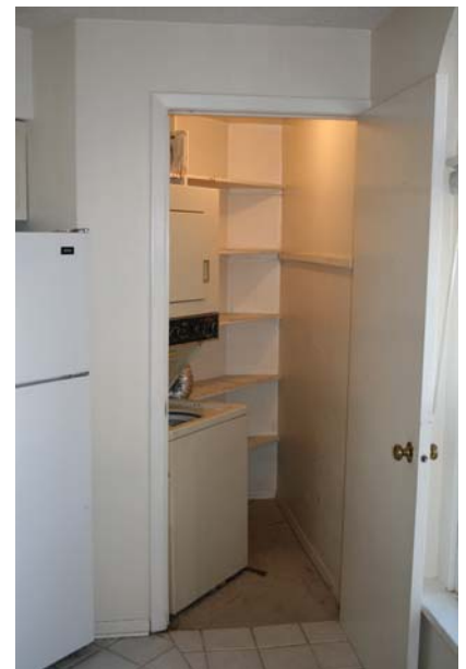
Second Floor: View of laundry at Flat-Iron building corner