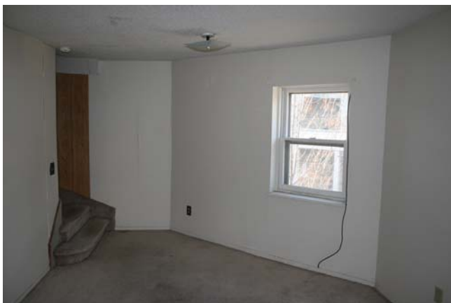
Second Floor Apartment: Living Room