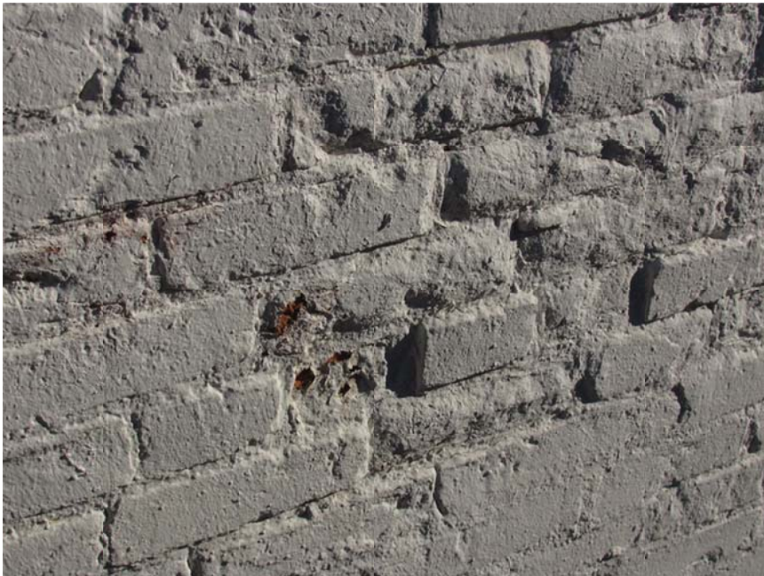
Figure 4. The coating layers were applied over unrepaired deteriorated masonry.