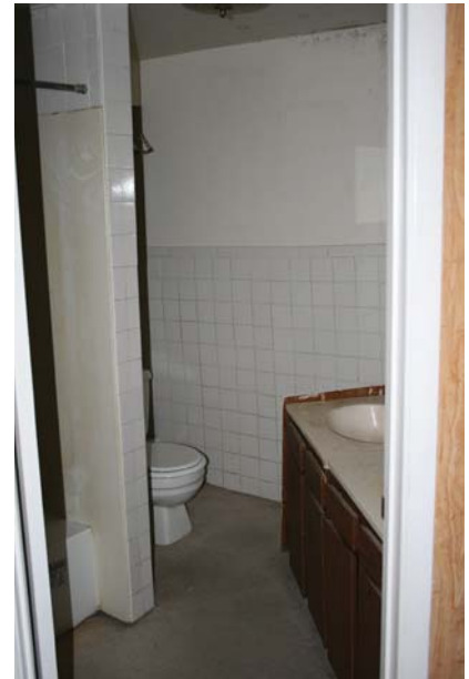
Third Floor: Bathroom