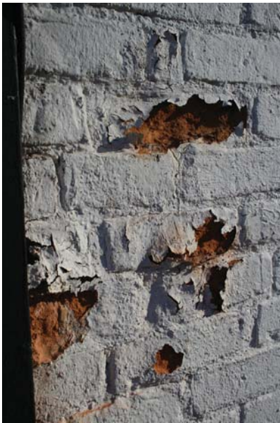
Exterior: View of damaged brick veneer