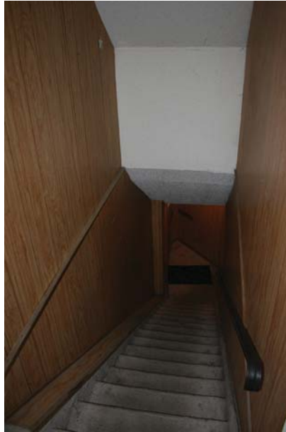
View of entrance stair access from north Fairchild Street