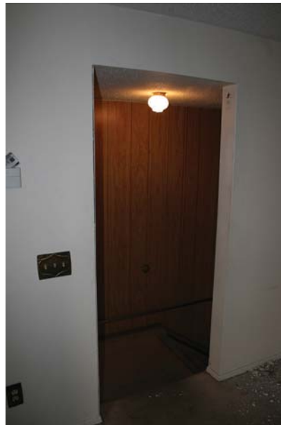
Second Floor: Entry stair from first floor showing wood paneling