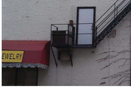
Apartment condensing unit