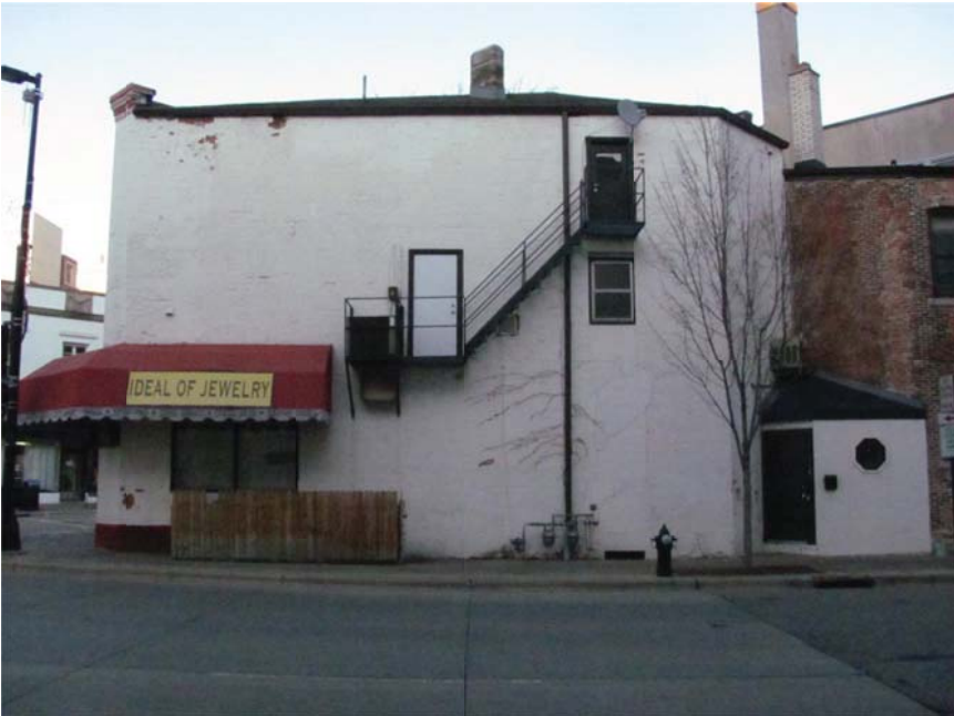
Figure 2. Overall view of the Fairchild Street facade.