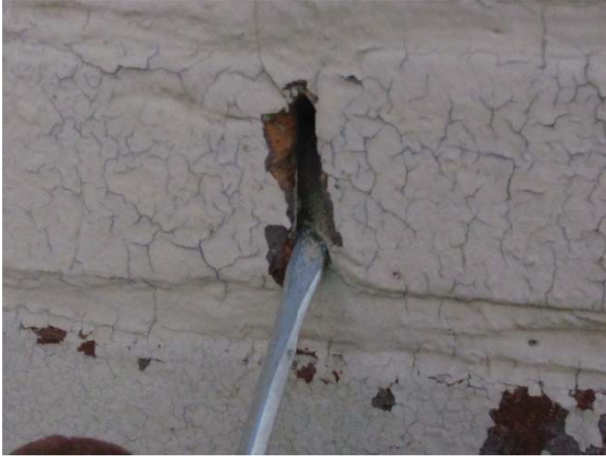
Figure 5. Mortar behind the coating layers is friable and has disintegrated.