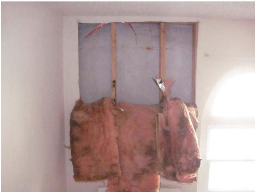
Figure 12. Staining and evidence of moisture penetration was observed on the batt insulation and plaster at an inspection opening created at the third floor during the site visit.