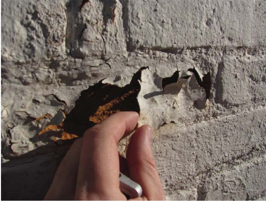
Figure 3. Loss of the coating reveals severely deteriorated brick units.