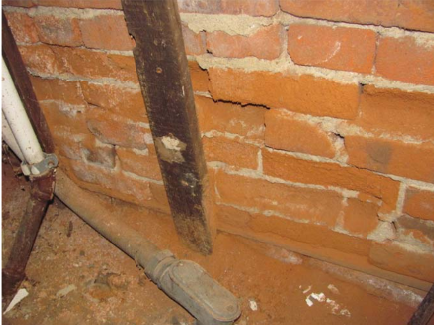
Figure 7. Deterioration of the back-up masonry at the interior of the building.