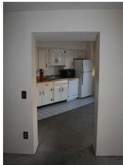
Second Floor: Structural bearing wall between living room and kitchen