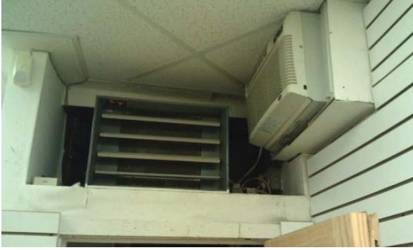
Corner retail heating and cooling