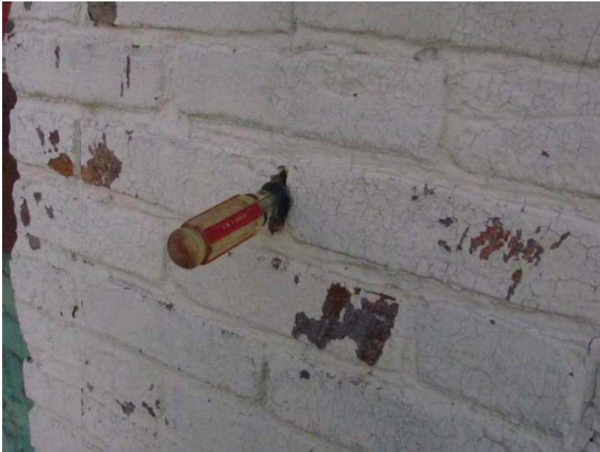
Figure 6. Mortar behind the coating layers has disintegrated, resulting in voids within the masonry construction.