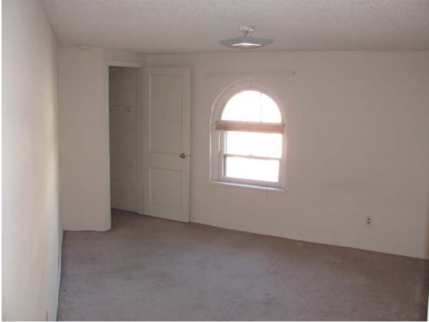
Figure 11. Typical view of the interior of the rental apartment.