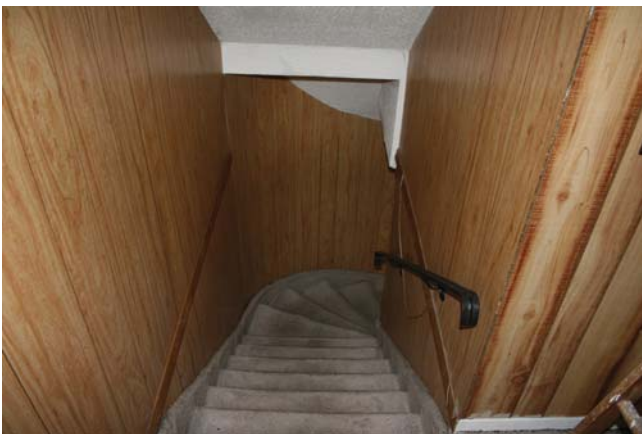
Third floor: View down stairs toward the second floor