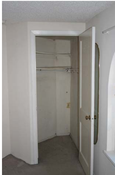
Third Floor: View of bedroom closet at Flat-Iron building corner