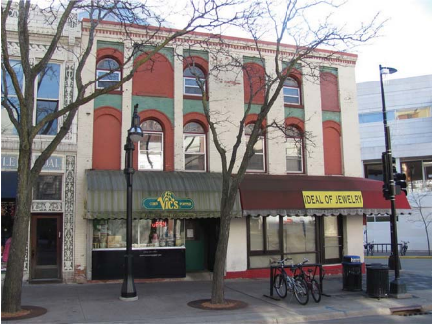
Figure 1. Overall view of the State Street facade.