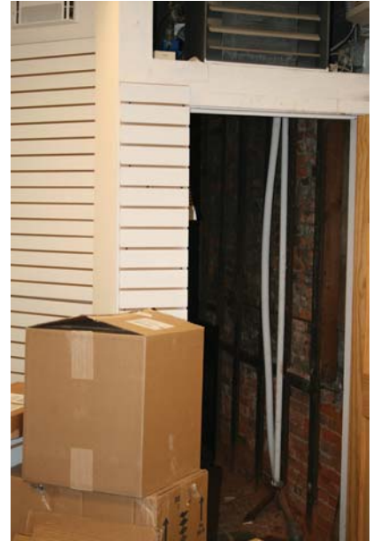
First Floor Retail