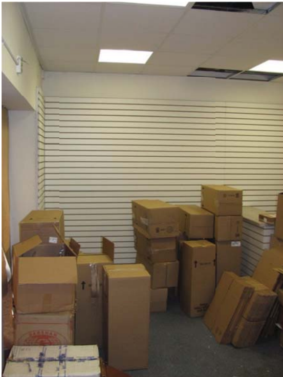
Figure 10. View of the retail interior at the first floor.