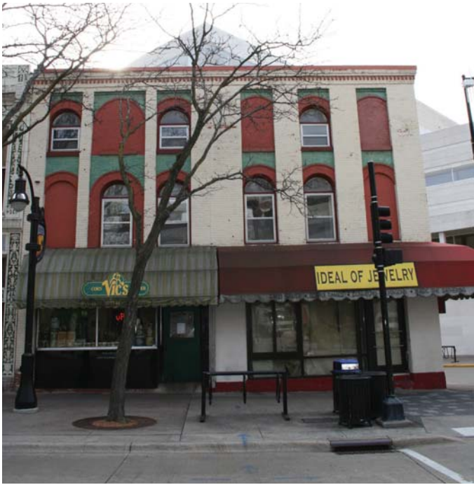
View of Front Facade