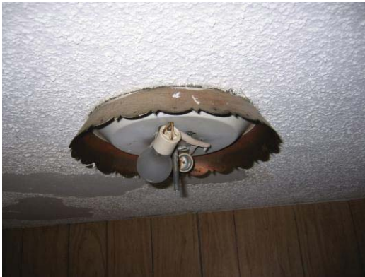
Light fixture in 119 North Fairchild Street (2 nd floor apartment.)