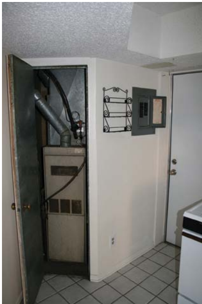
Second Floor: Mechanical and door to fire escape