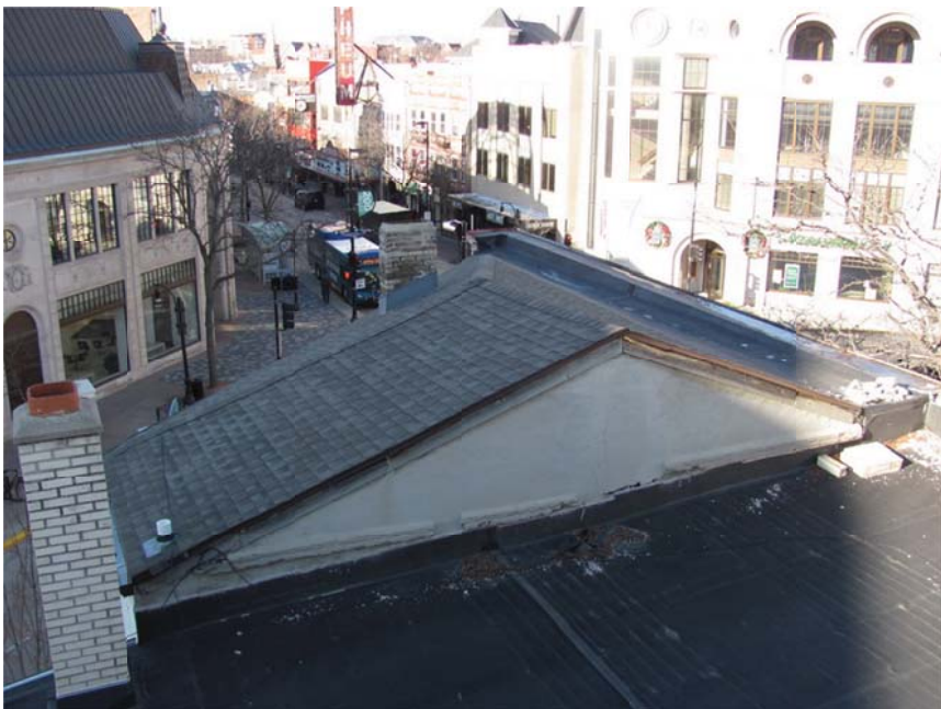
Figure 8. Overview of the roof.