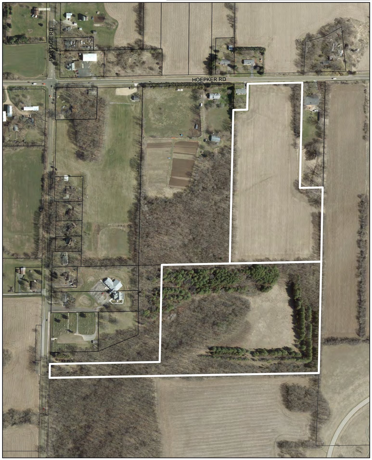
Date of Aerial Photography : Spring 2022