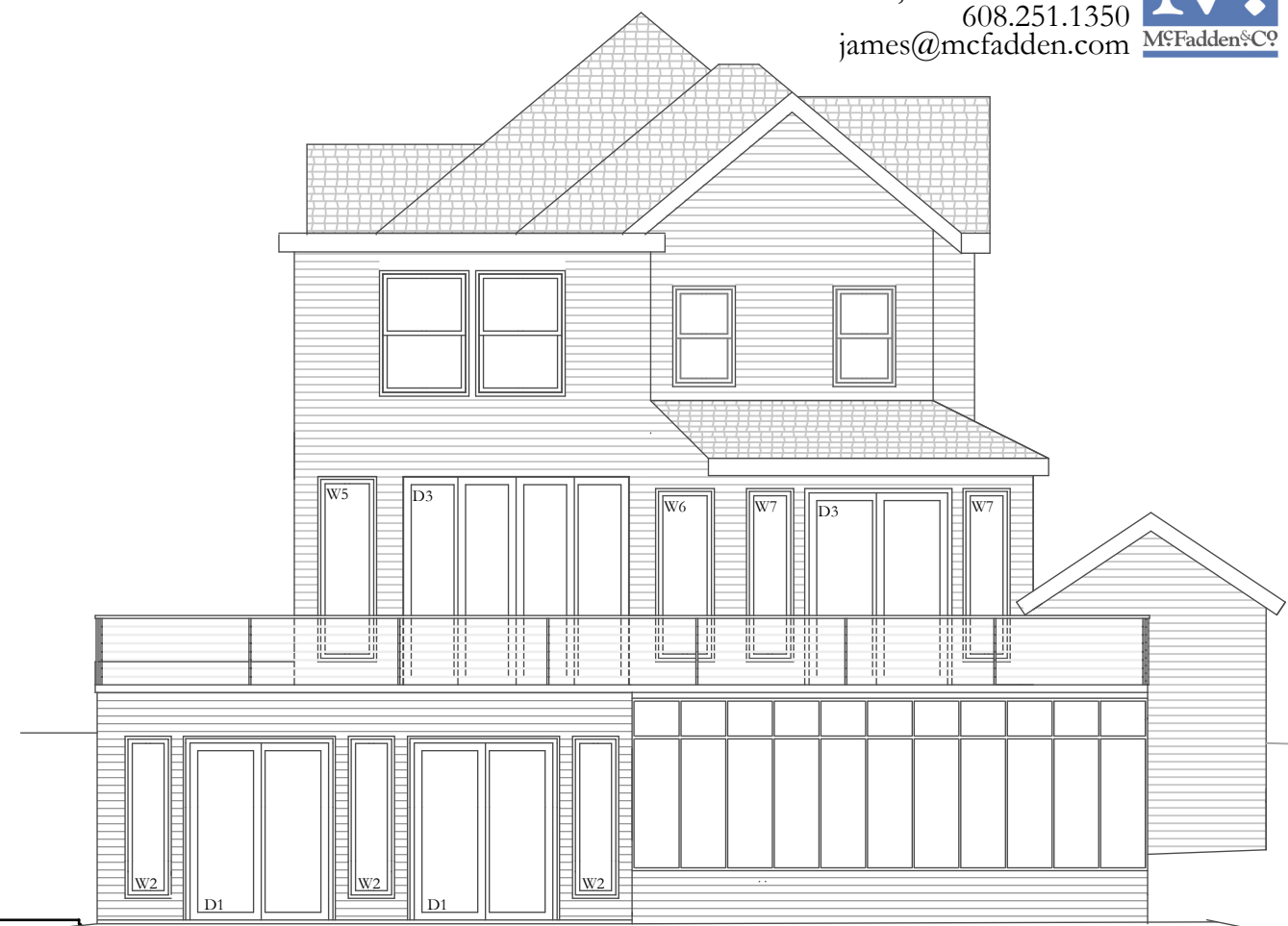
South or Lake Elevation