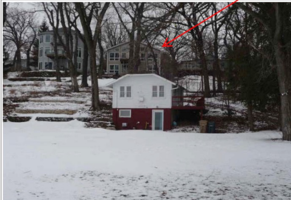
~2012 time of sale