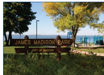
Scenes from James Madison Park