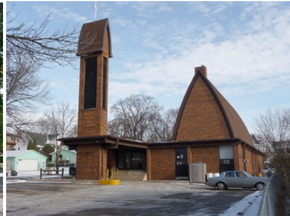
WHS Property Record #105883