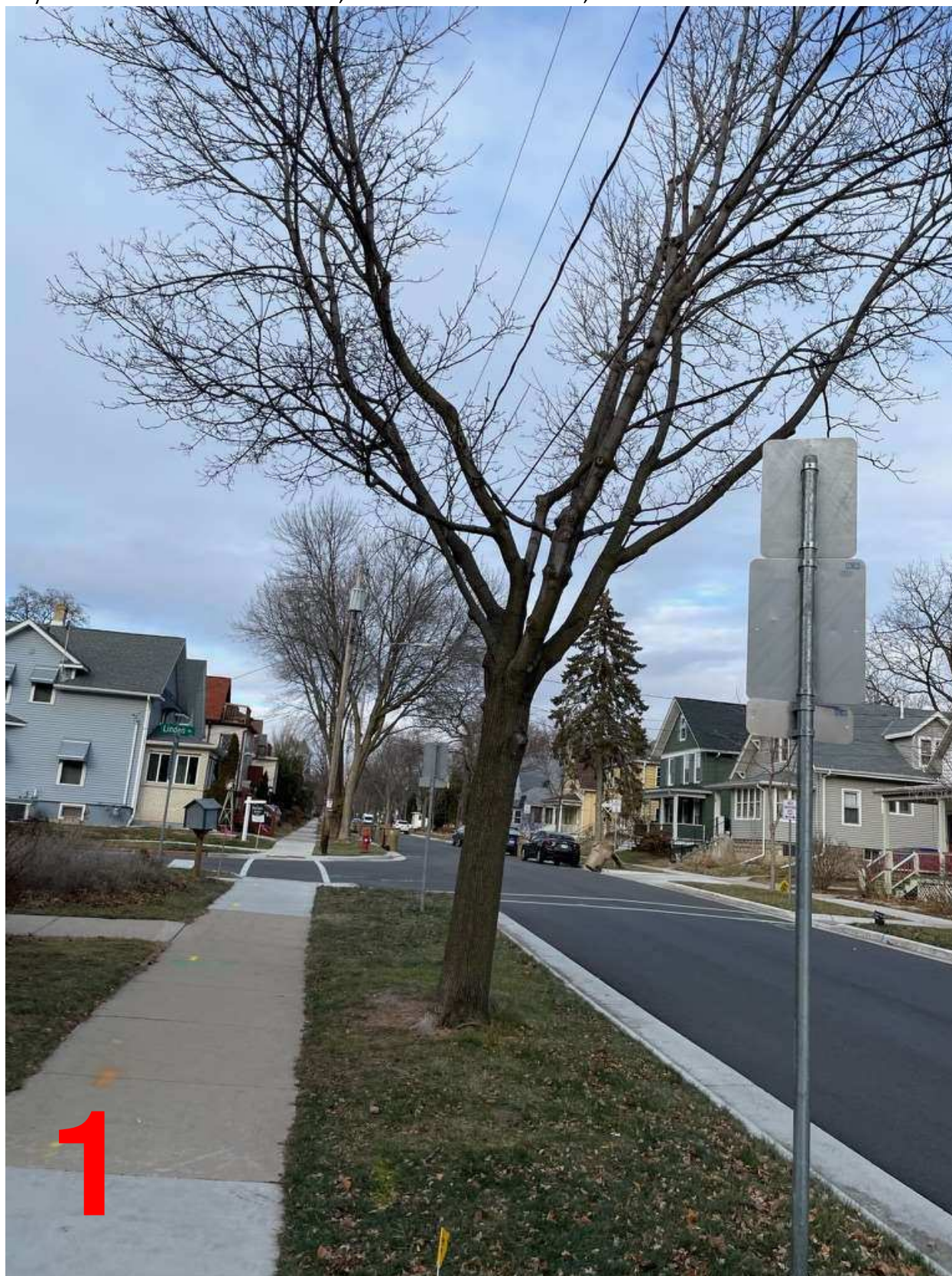
City Tree Photos 2165 Linden Ave, Madison -December 21,2021