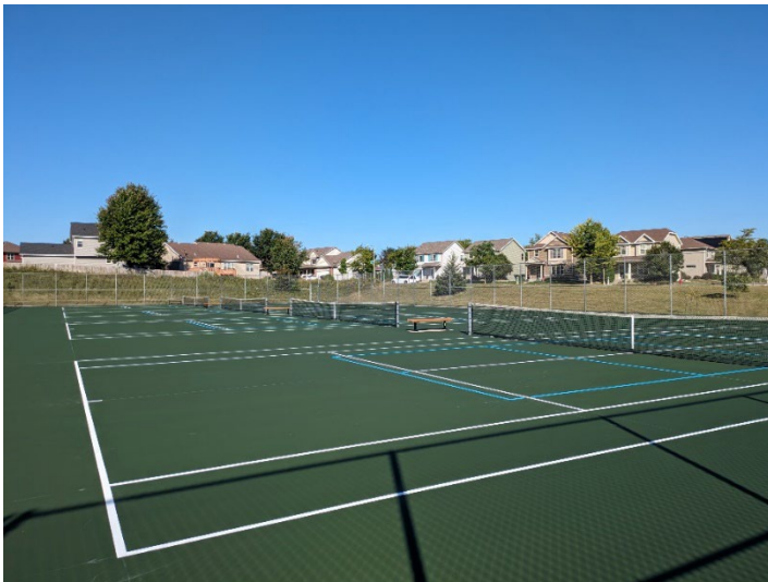
Maintenance work complete at Door Creek Park N pickleball/tennis courts.