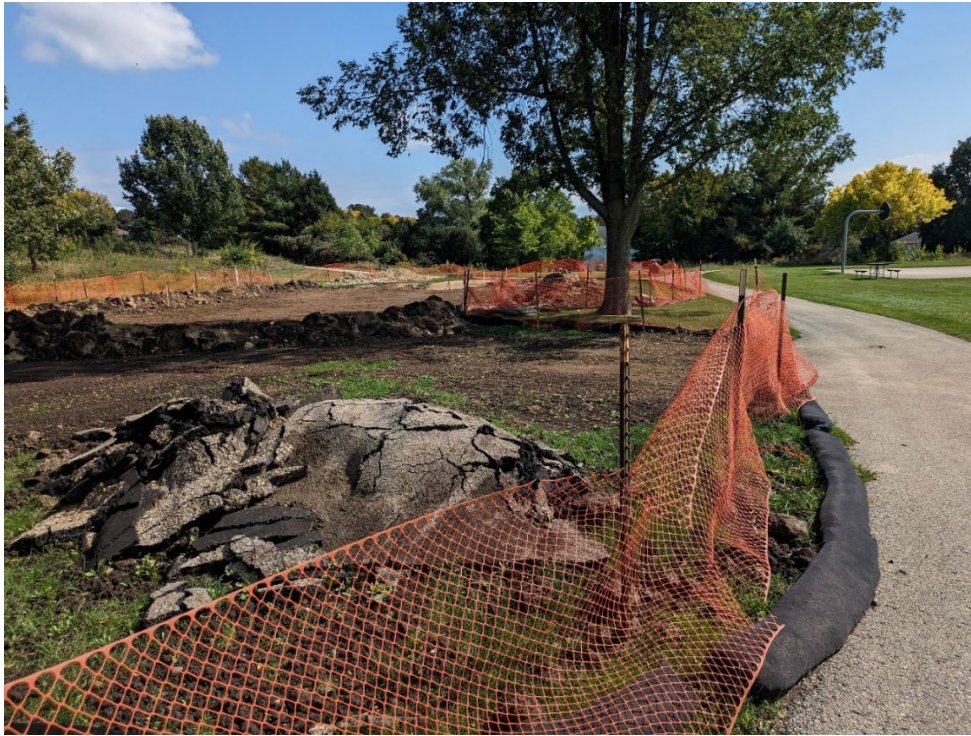
The worksite at Maple Prairie Park playground.