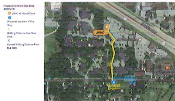
Journey Mental Health Center Bus Stops

https://drive.google.com/open?id=1-dJdGSBbhL5AedldRlw-G4YdYUA&usp=sharing