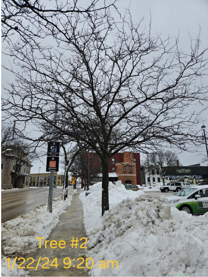
Tree #2 1/22/24 9:20 am