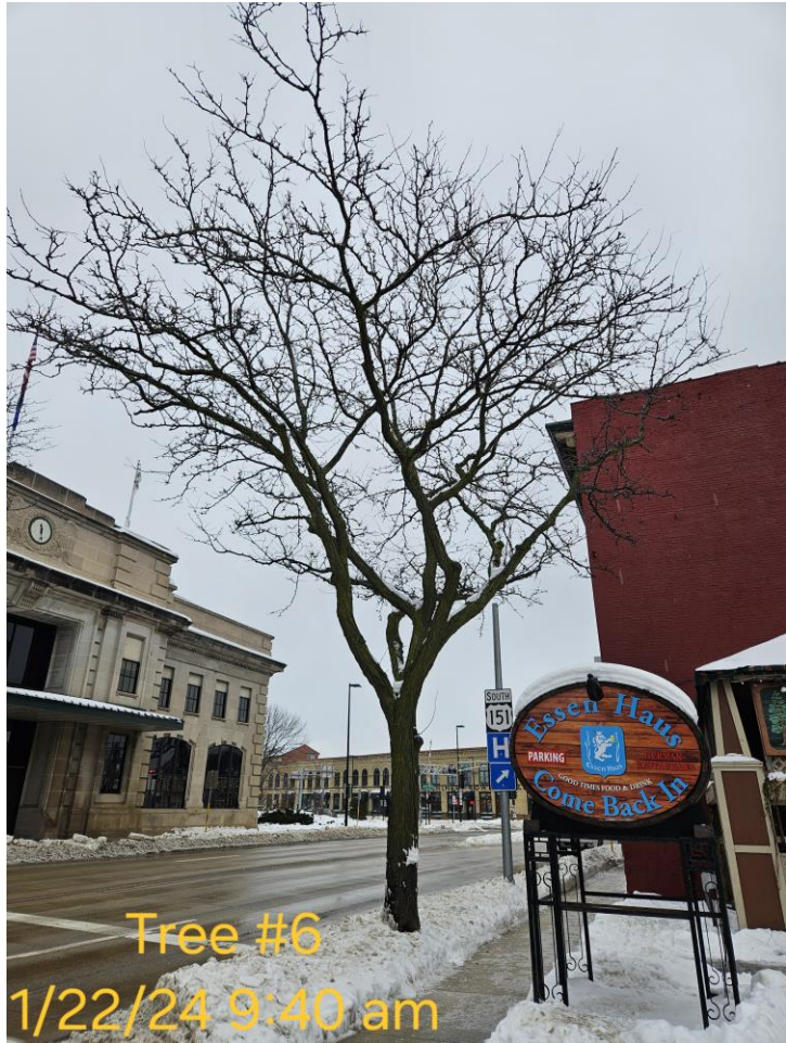
Tree #6 1/22/24 9:40 am