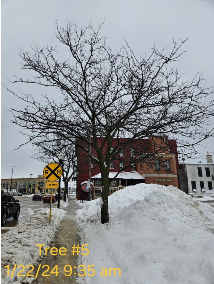
Tree #5 1/22/24 9:35 am