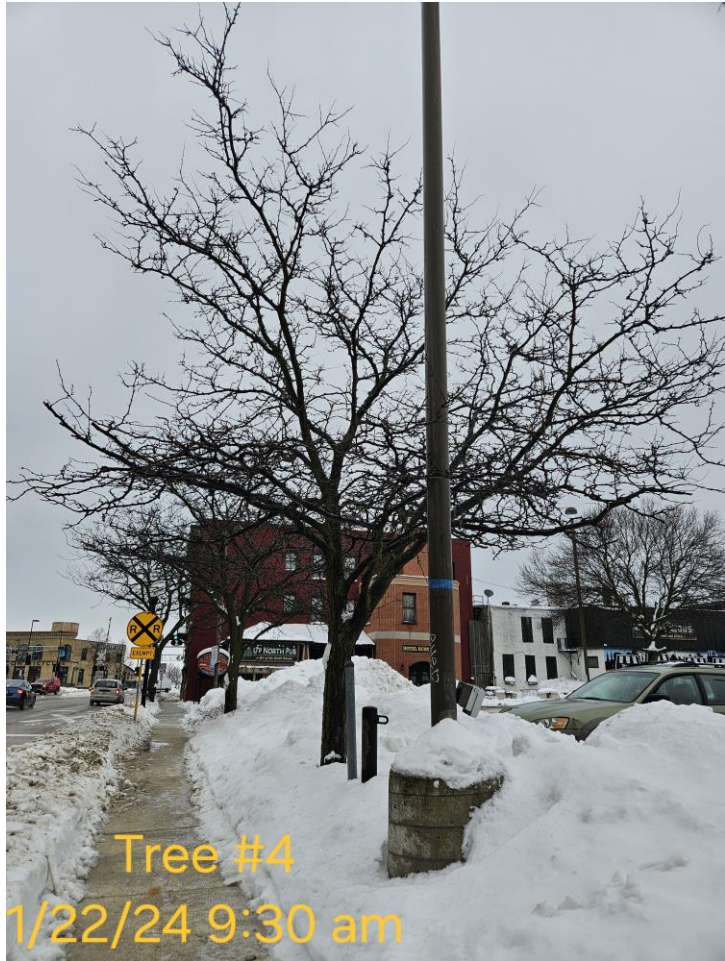
Tree #4 1/22/24 9:30 am