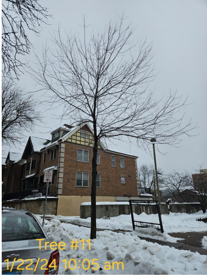
Tree #11 1/22/24 10:05 am