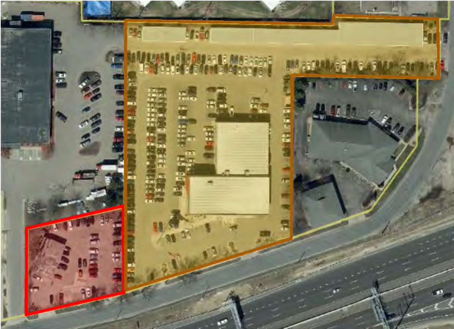
2022 Aerial Photograph