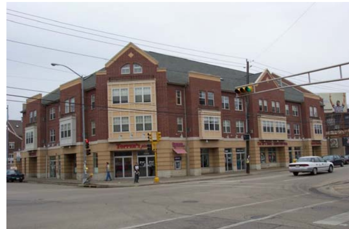
Example of Residential / Commercial Mixed Use – Regent Street