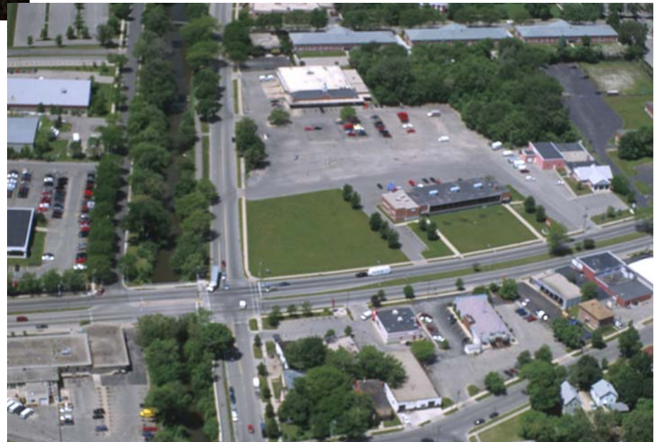
View of the South Park Street and West Wingra Drive intersection (looking west). Madison Labor Temple, US Post Office and leased surface parking lot in the foreground. Wingra Creek flows easterly along the southside of West Wingra Drive.