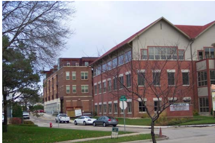
Example of Mixed-Use Development - Kennedy Place, Atwood Avenue