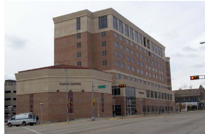
Example of Specialized Lodging / Conferencing Facility - Fluno Center, University Avenue