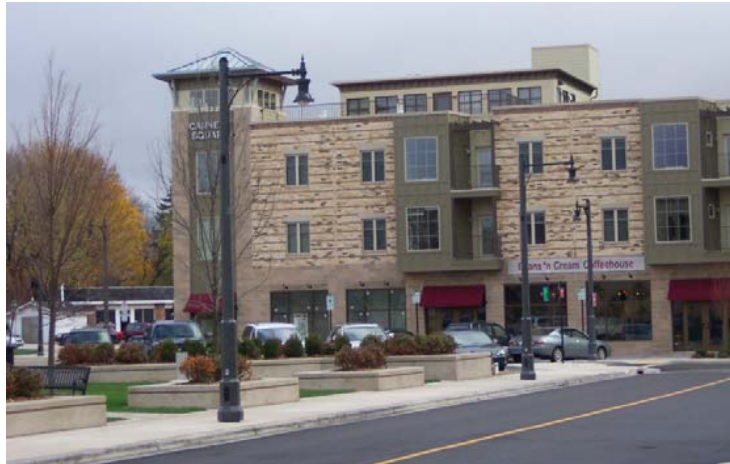
Example of Mixed-Use Development - Cannery Square, Sun Prairie