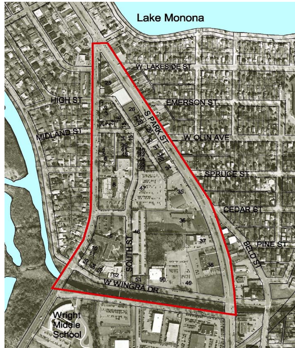
Map 7: Wingra Creek Target Area: Parcel Analysis