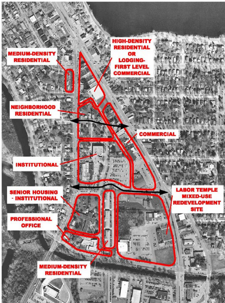
Map 4: Conceptual Land Use Plan for the Wingra Creek Project Area