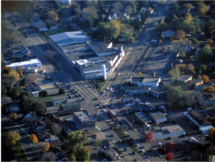
View of Dean/Morningstar Dairy site (looking south) at the intersection of South Park Street and Fish Hatchery Road. The building has been vacant since June 2004. Manufacturing equipment and other mechanicals have been removed from the building/site.