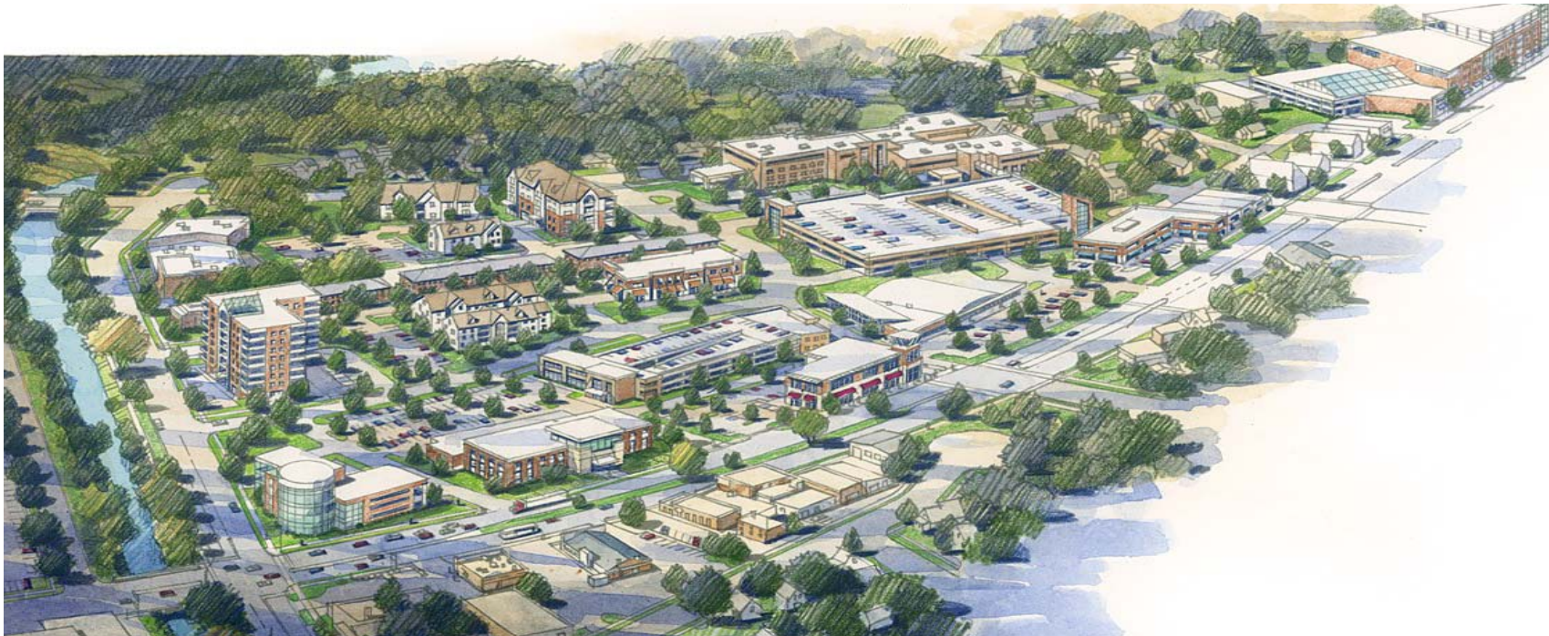
Map 5: Bird's Eye Perspective: Park Street and Wingra Drive Intersection. A mixed-use, transit-oriented development that would include office, housing, and commercial elements

Two conceptual renderings were prepared to illustrate the Wingra Creek Project Area recommendations.