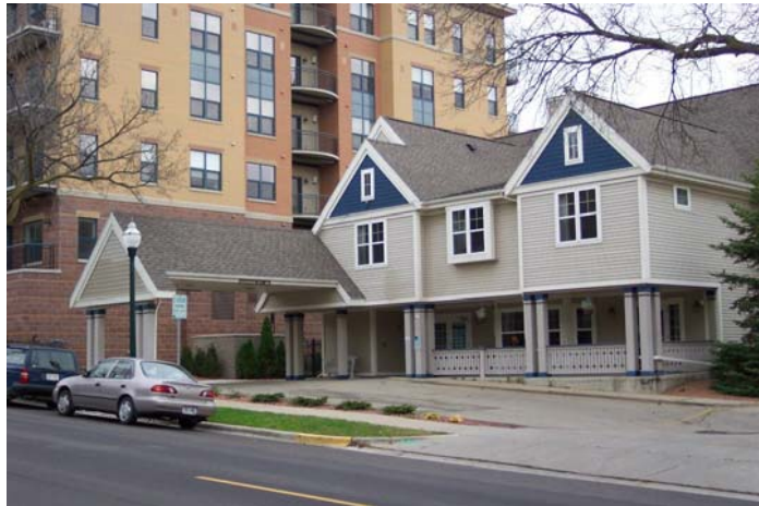
Example of a Retirement Community – Meriter Retirement, Main Street