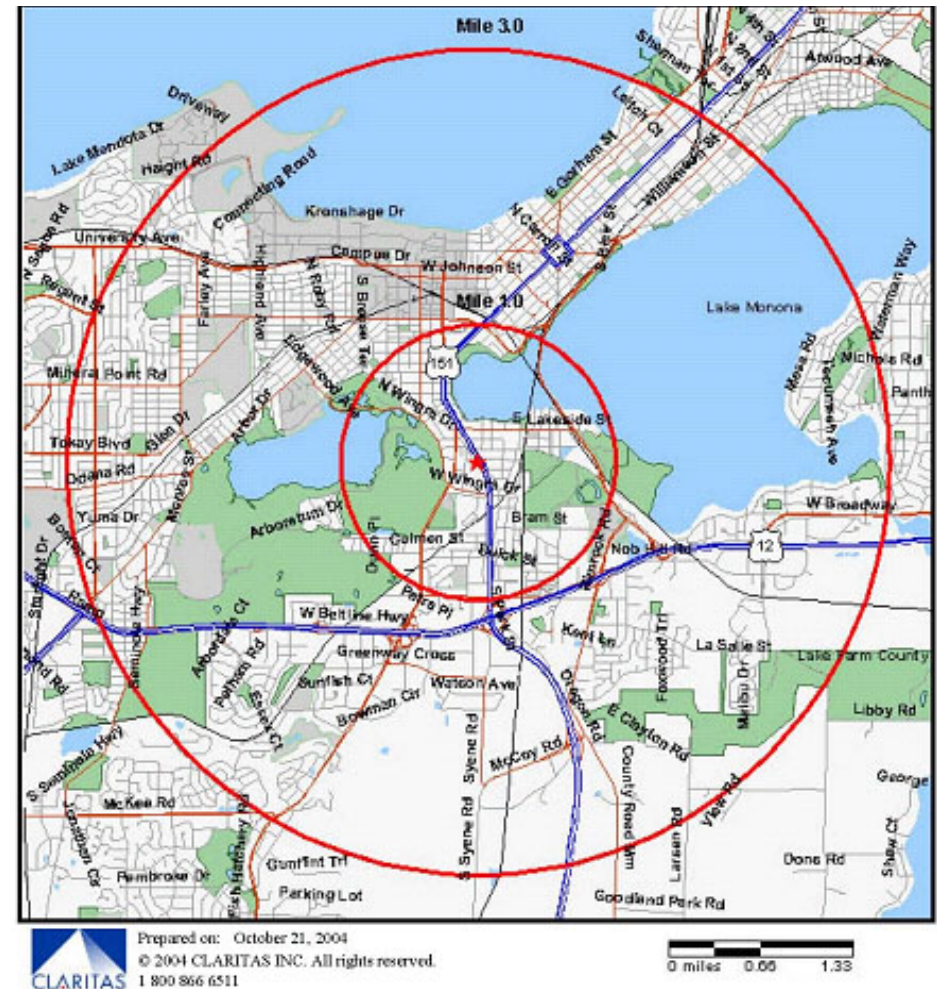
Map 3: Primary and Secondary Market Areas