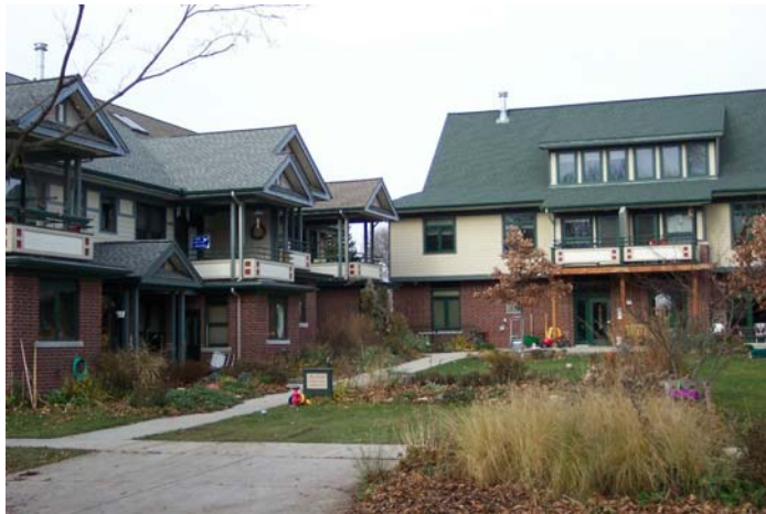
Example of Neighborhood Infill – Mound Street