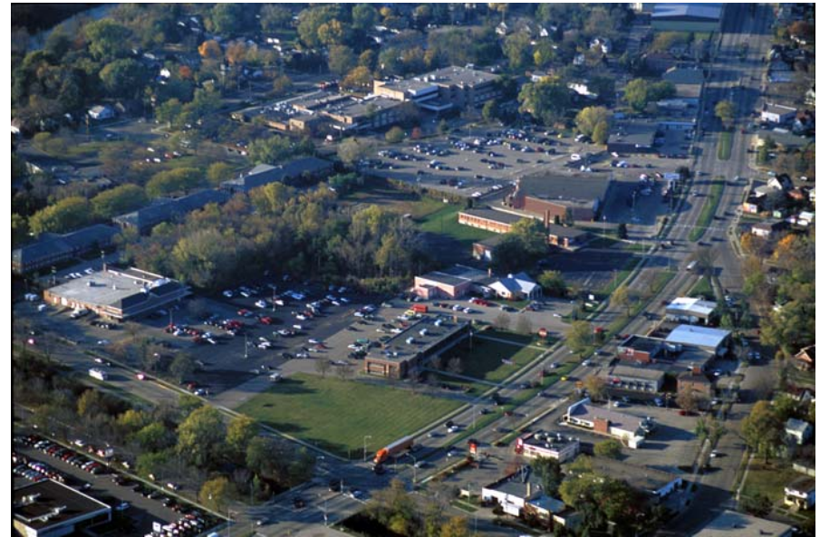
South Park Street and Fish Hatchery Road bound the Wingra Creek Target Area. Madison Labor Temple, U.S. Post Office, and Dean Health System are located in the southern portion of the study area.

The Dane County Better Urban Infill Development Program (B.U.I.L.D.) assists local governments to prepare plans to redevelop and promote infill development within parts of their communities that may have become obsolete, rundown, or environmentally contaminated. The City of Madison was fortunate to receive two grants of $25,000, totaling $50,000, to assist in the planning for the Wingra Creek B.U.I.L.D. area. South Metropolitan Business Association (SMBA) contributed $5,000 toward the market study.