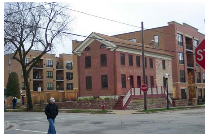
Example of Mid-Density Housing (40 DU/AC) – Main Street