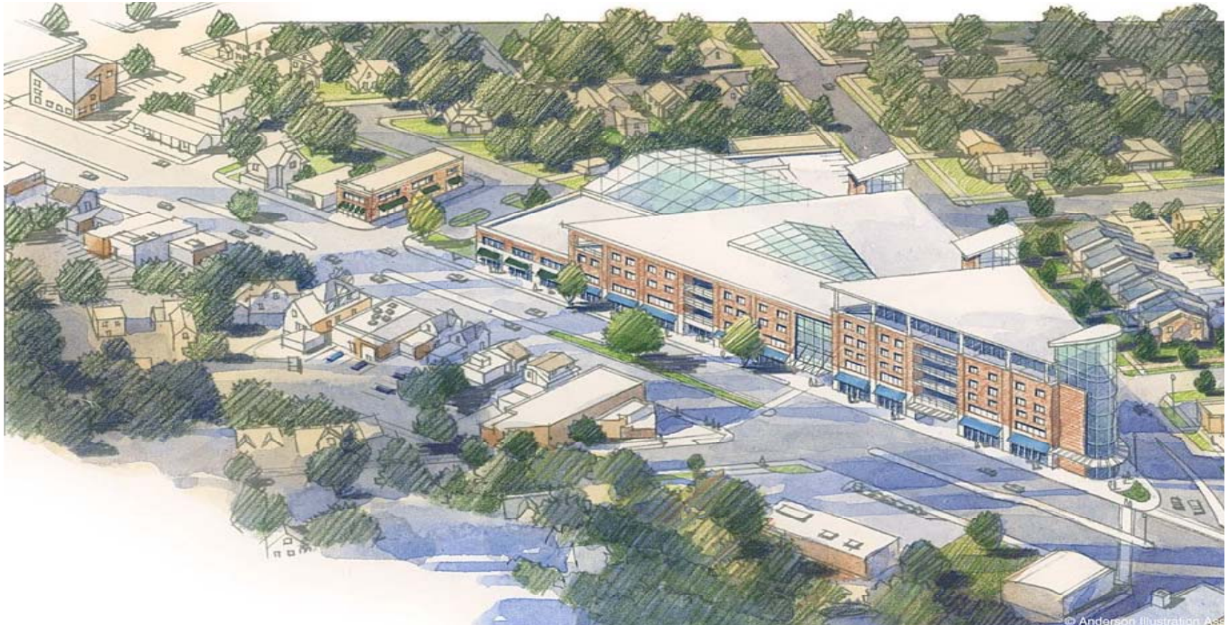
Map 6: Bird's Eye Perspective: Park Street and Fish Hatchery Road Intersection. A flat iron building of high quality, urban design that would include a mid-rise residential development or a specialized lodging/conferencing facility.