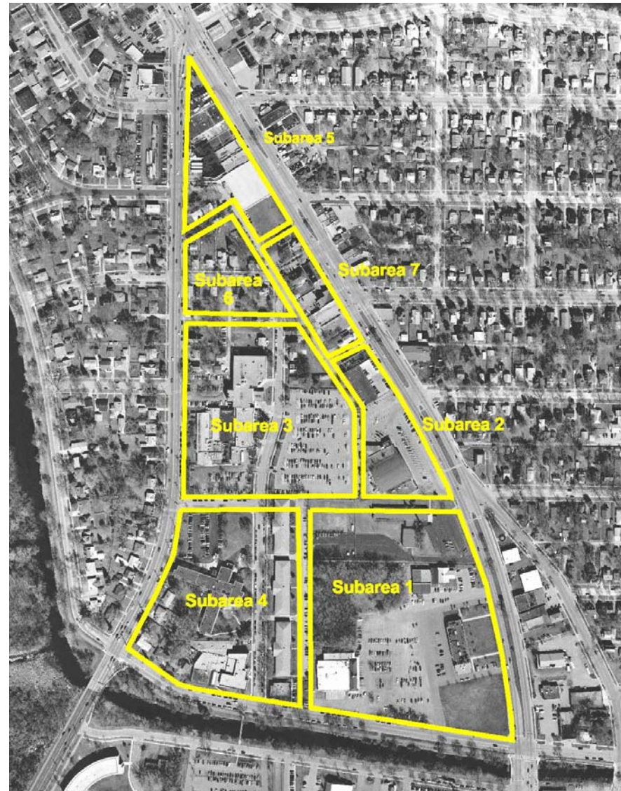
Map 8: Wingra Creek Target: Subareas