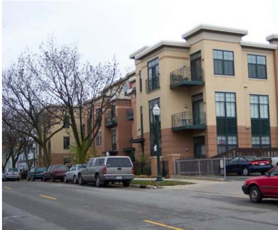
Example of Mid-Density Residential (40 DU/AC) – Main Street