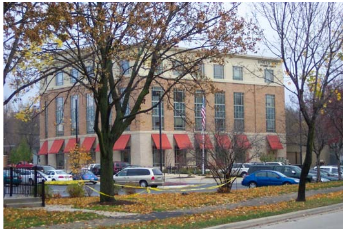
Example of Mid-Rise Office Structure – United Way, Atwood Avenue