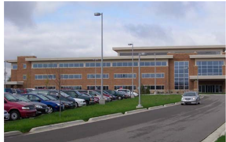
Example of Medical Clinic - Dean East, Stoughton Road