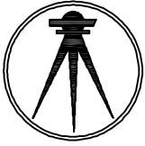
EXHIBIT B: PLE AREA