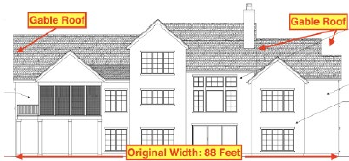
Original Design – East Elevation