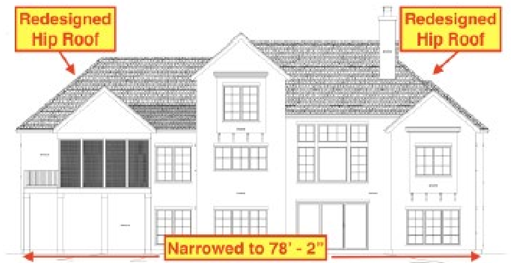
Redesigned – East Elevation