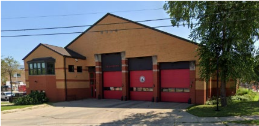
Google Street View

Commercial building (fire station) constructed in 1986.