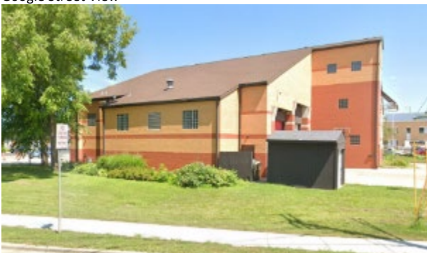
Google Street View (Perry Street elevation)