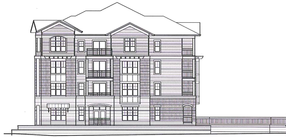
END ELEVATION ALONG MAYO DRIVE 5/32" = 1'-0"