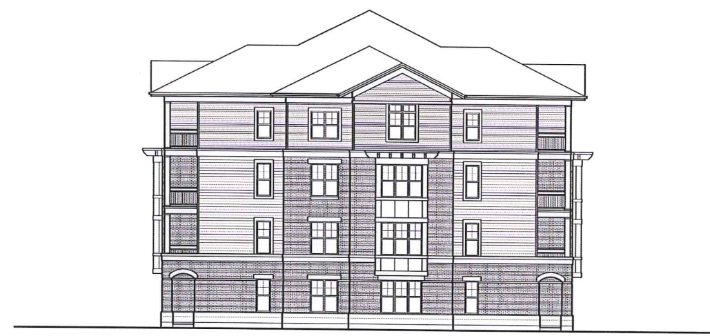
○ END ELEVATION 3/32" = 1'-0"