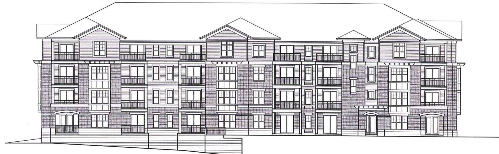
REAR ELEVATION 5/32" = 1'-0"