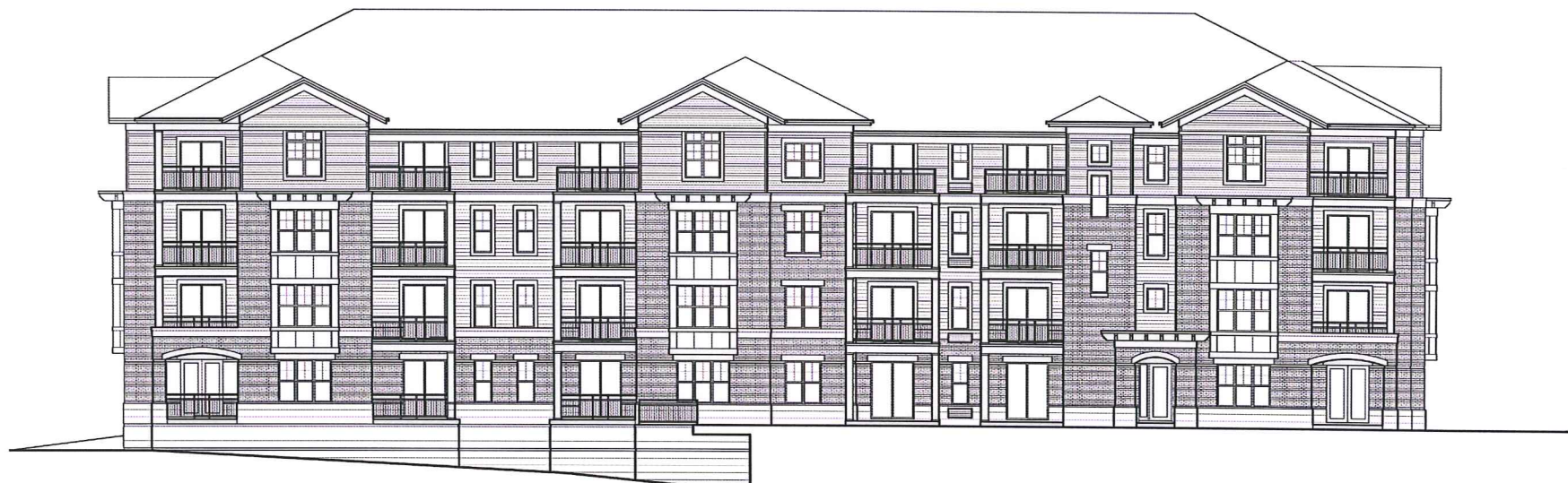
○ REAR ELEVATION 3/32" = 1'-0"