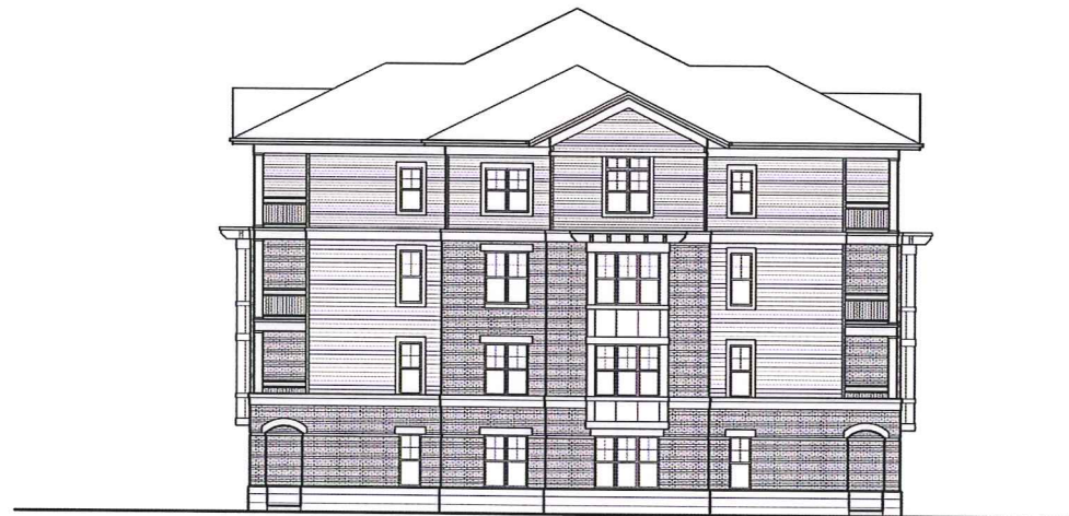
END ELEVATION 5/32" = 1'-0"