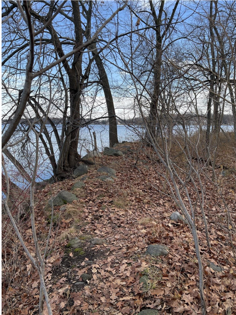
Ice Ramps at Turville Point - Land View 12-8-2023

Much of the shoreline of Turville Point Conservation Park is a natural shoreline. Thousands of years of wind and wave action have cut away some of the original shoreline of the glacial hills in Olin-Turville Park. During that same time, thousands of years of winter ice heaves have slowly pushed the remaining cobbles and boulders along the shoreline further onto the shore each winter to create most of the existing cobble and boulder coated shoreline. This place is absolutely beautiful with the glacial cobbles and boulders along much of its shoreline!