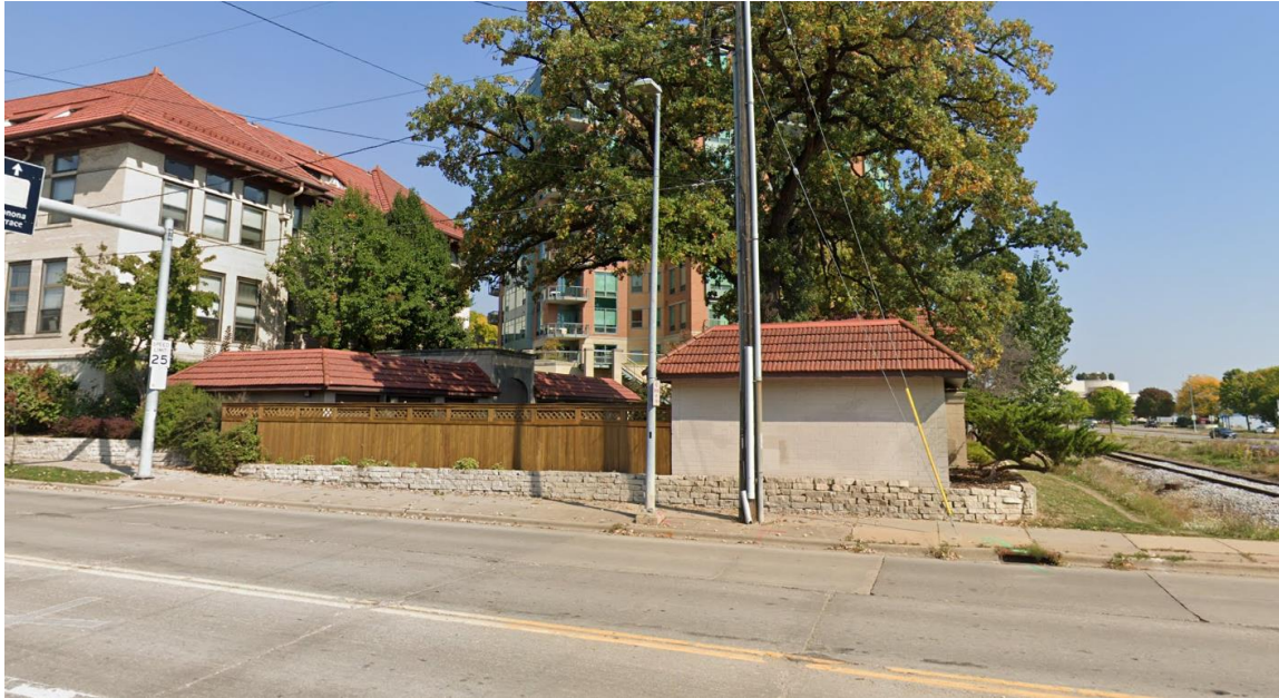
451 W. Wilson Street along the Broom St. side of that lot.

I have already submitted to the Madison Engineering Department my suggestions for new elevations for the John Nolen drive roadway and rail corridor as well as elevation data for an underpass that has a 10 foot height clearance and the ped/bike path through the underpass would be at elevation 848 feet on the lake side and 846 feet at the rail corridor.