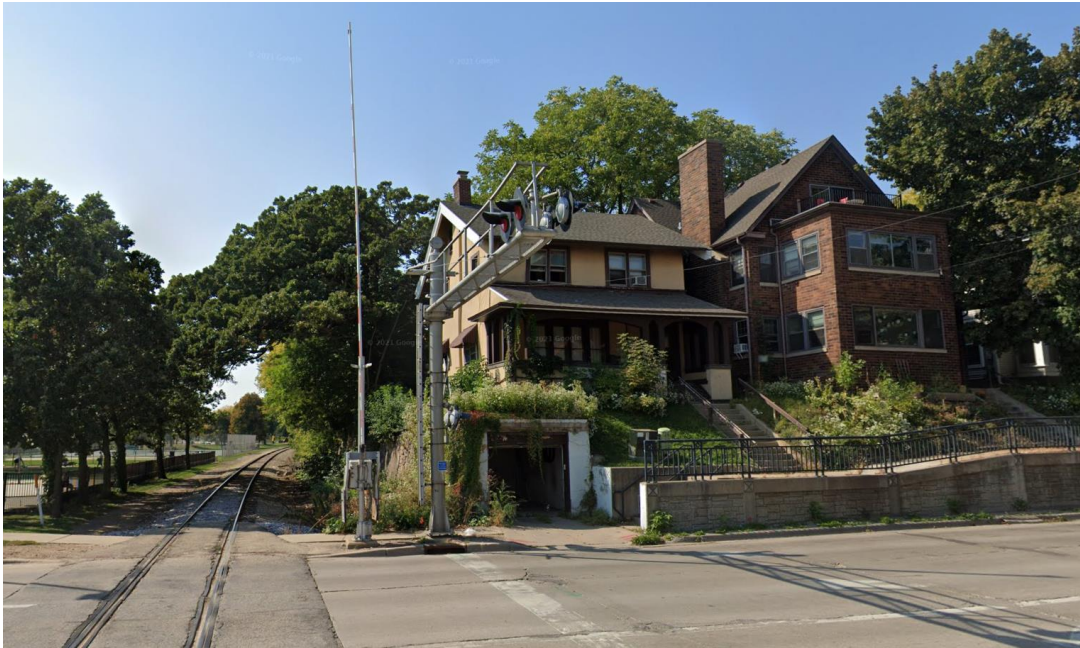
318 S. Broom Street

And what can be done with that public sidewalk on the south side of Broom Street at the rail corridors along JND? This sidewalk is currently not ADA compliant. There is a seven step concrete stairway at that location today. If Broom Street and the rail crossing at this intersection is raised 5 feet the stairway can be eliminated. The dilapidated garage at 318 S. Broom Street could be removed for the property owner at no cost to the owner and other parking arrangements be made for occupants of the property. See image below.