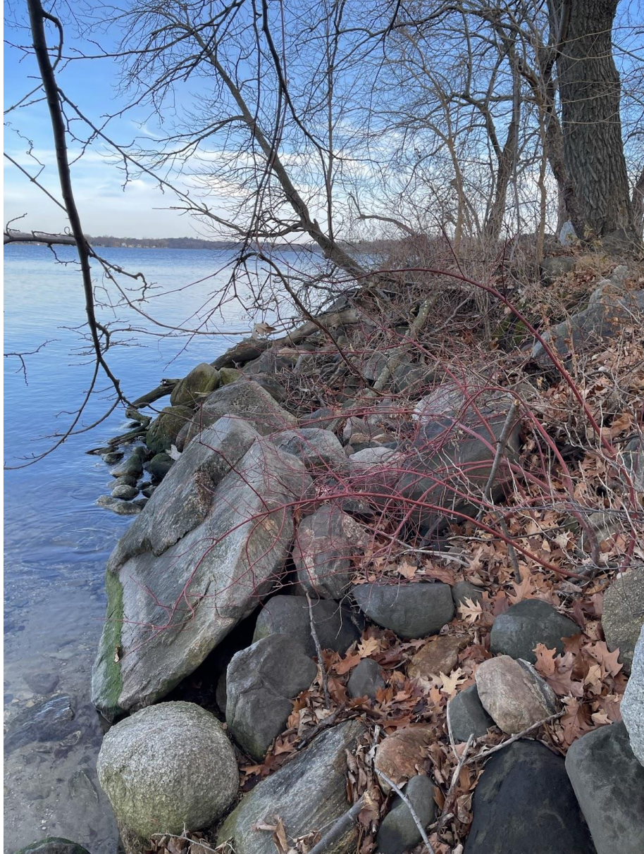
Ice Ramps at Turville Point - Lake View 12-8-2023