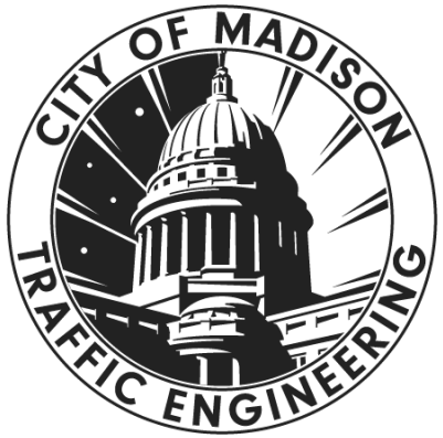
City of Madison Traffic Engineering