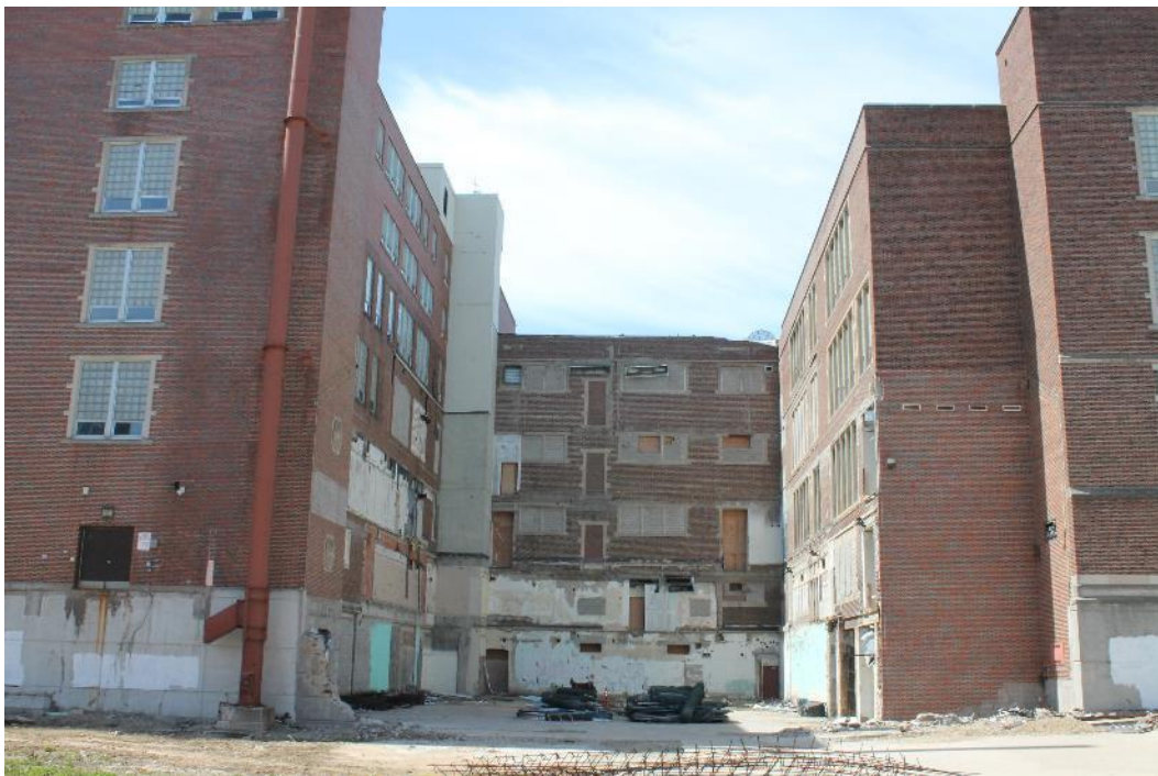
Figure 3. Photo 2 looking southwest