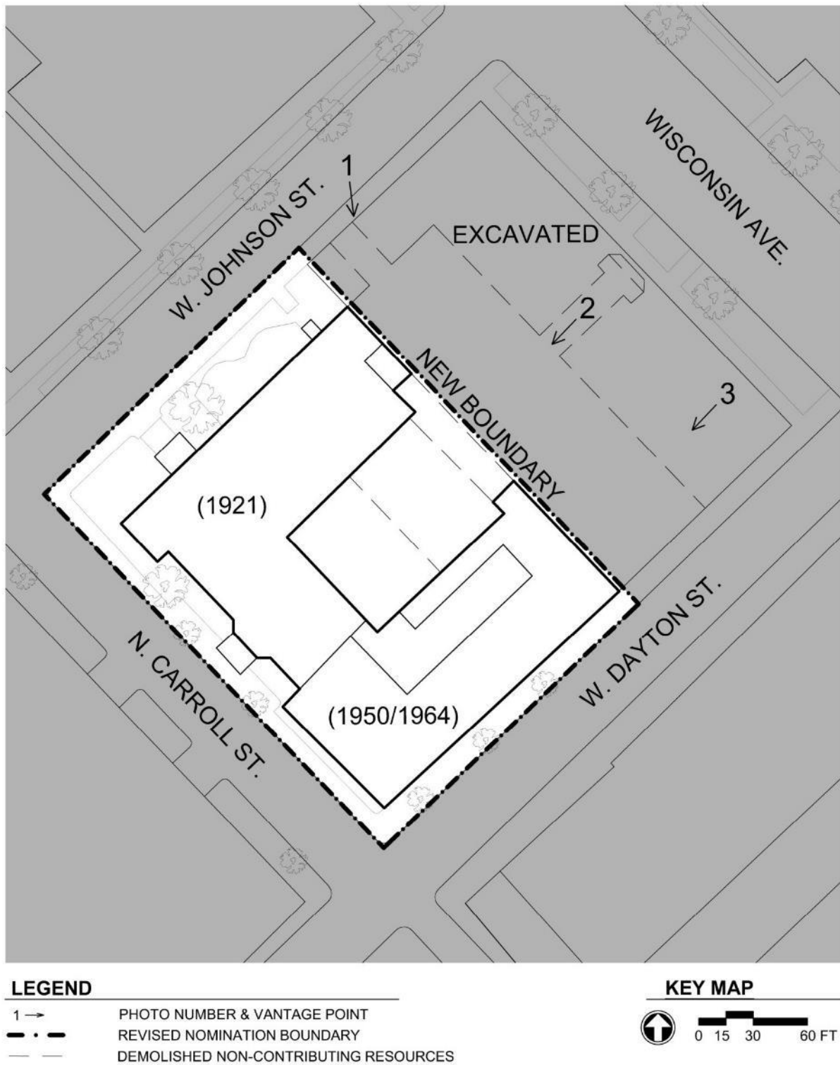
Figure 1. Site Map and Photo Key