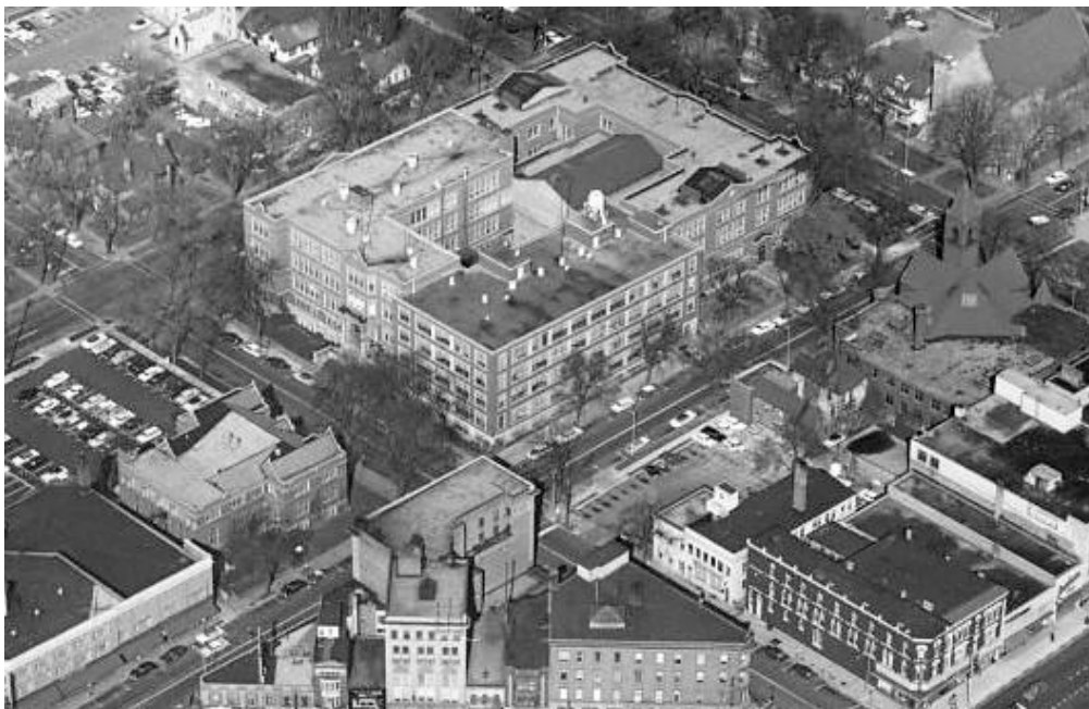
Figure 7. 1964 Aerial Photography looking north, City of Madison, On file at the Wisconsin Historical Society Archives.