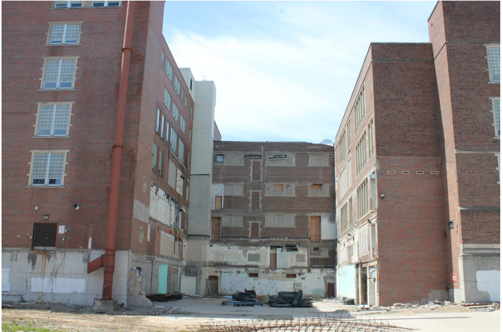
Madison Vocational School (Additional Documentation, Boundary Decrease), Madison, Dane County, 2 of 3