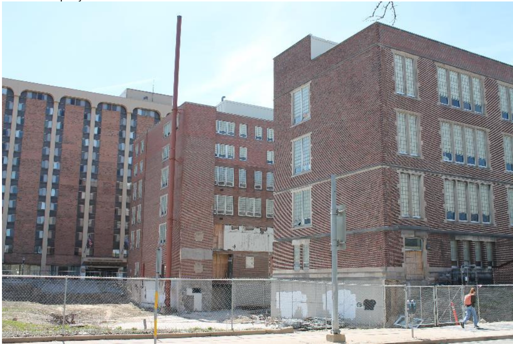
Figure 2. Photo 1 looking south