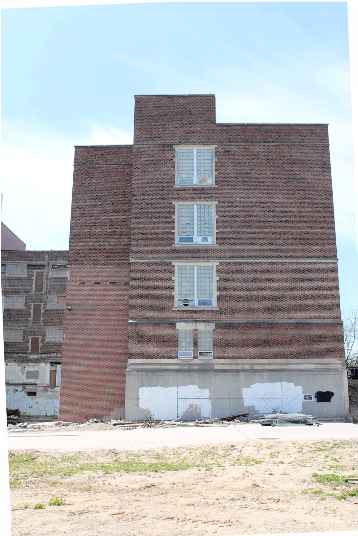
Madison Vocational School (Additional Documentation, Boundary Decrease), Madison, Dane County, 3 of 3