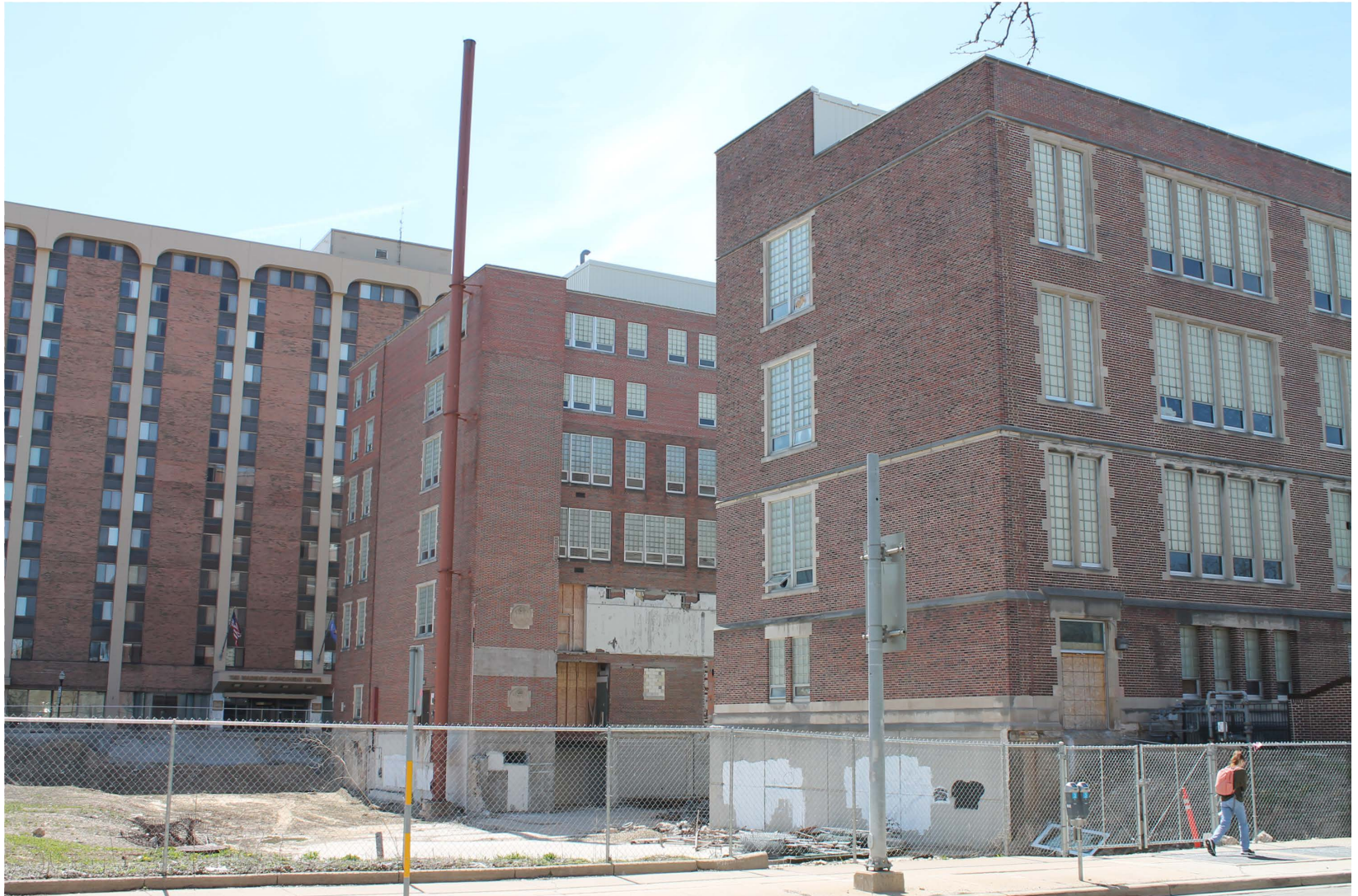
Madison Vocational School (Additional Documentation, Boundary Decrease), Madison, Dane County, 1 of 3