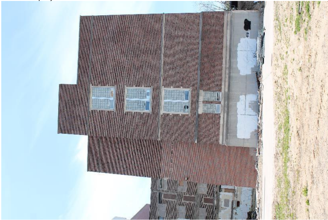
Figure 4. Photo 3 looking southwest