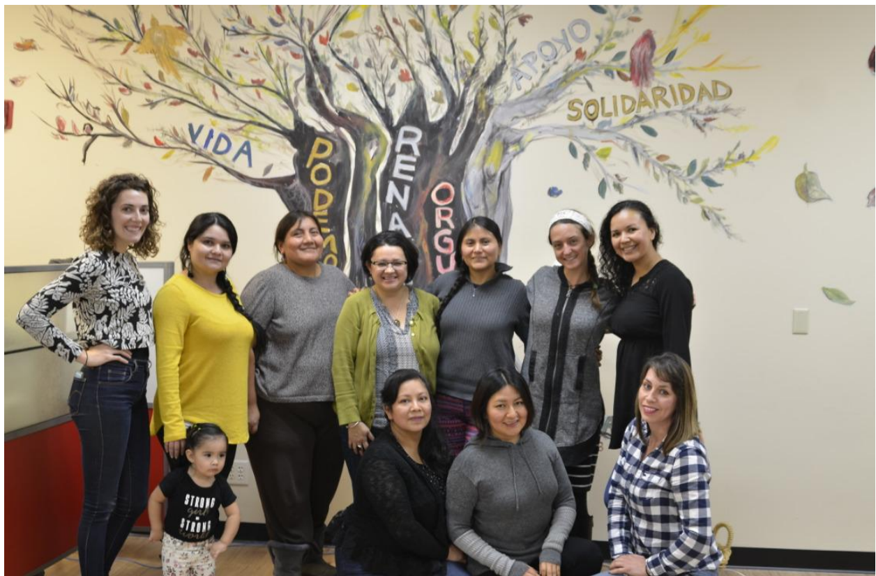
Members and supporters of Roots for Change, pre-pandemic.

MCDC made no grants to CIDs or CBOs this quarter. The issue was not lack of funds, but the pandemic and the difficult position of the global economy generally, and small, local businesses in particular. A number of businesses have closed in Madison, and many more are surviving on grants from the federal, state, or local government. That said, our existing CIDs continued to make progress. We expect Madison Cannabis Co-op, Ironroots Restaurant Co-op, and the Madison Area Cooperative Housing Alliance (MACHA) Co-op will be incorporated in Q1 2021.