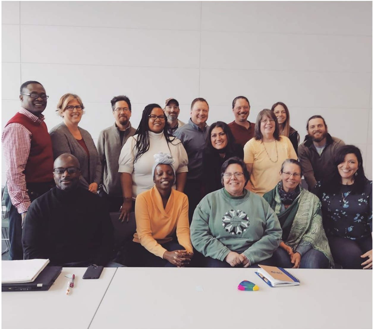
A group photo of many of the participants at the Regional Rendezvous in March.

municipal staff and elected officials, roundtable discussions, and a social event at Isthmus Engineering and Manufacturing Cooperative.