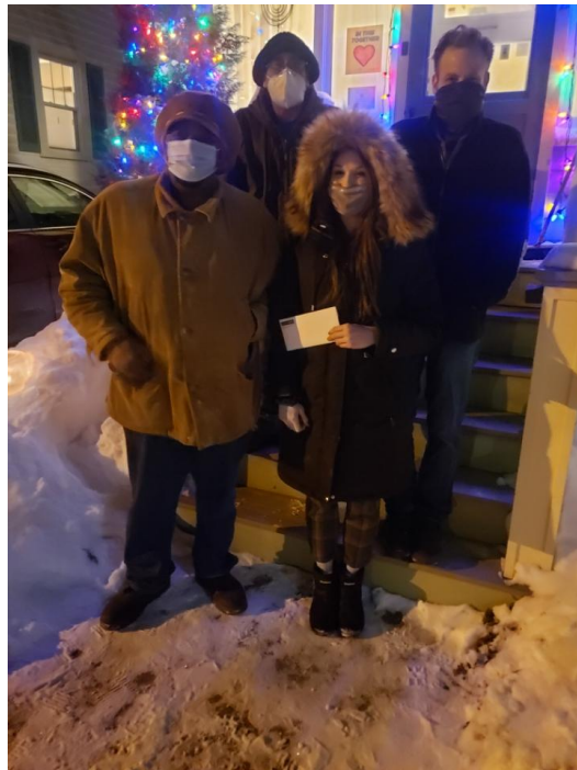
January 2021 is off to a good start! Here are members of the Madison Cannabis Cooperative signing their Articles of Incorporation to make their co-op official.