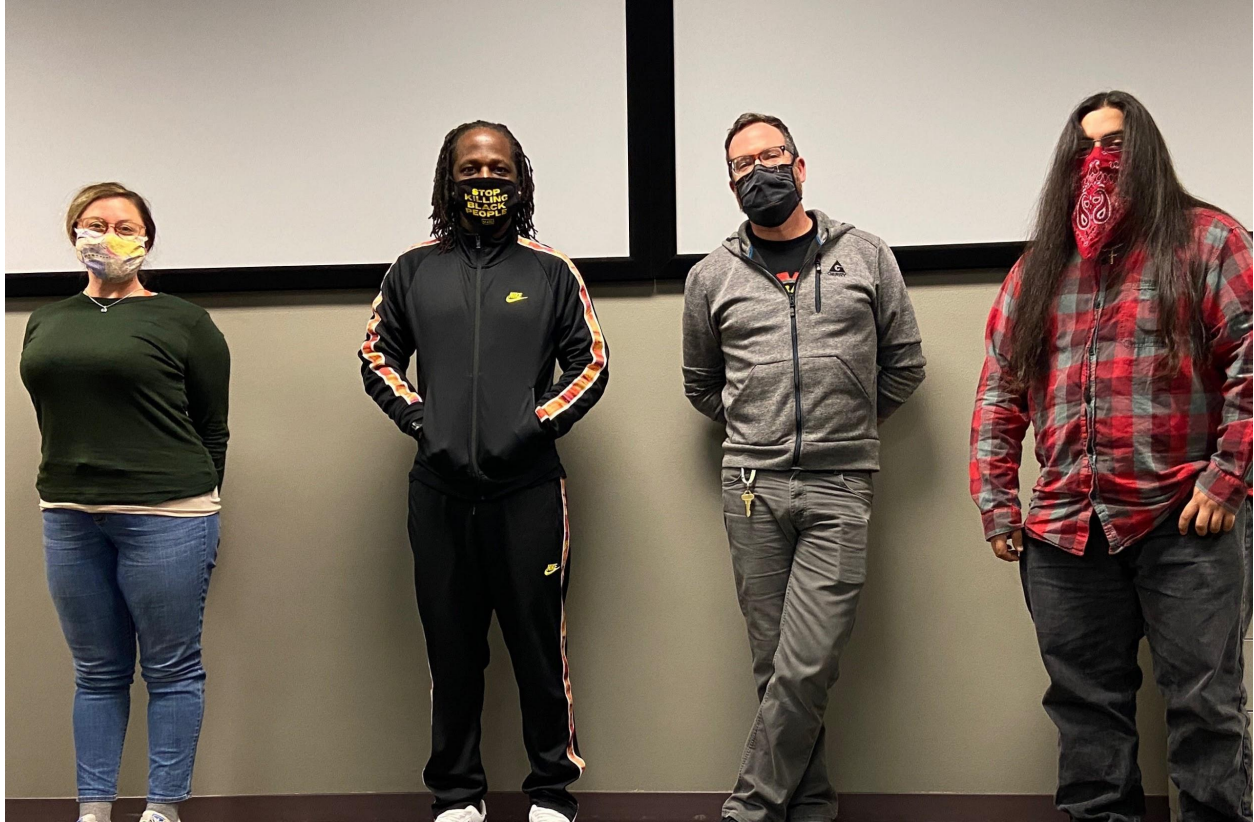
The members of Get It Right Cooperative.