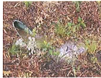
Rain garden doing its job