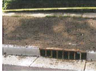
Water enters rain garden through a structure in the curb