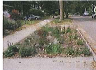
Pilot terrace rain garden on Rowley Avenue