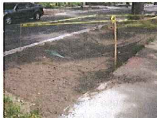
A plastic pipe takes water from the structure into the garden

Click on the image below to see our general terrace rain garden specifications.