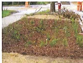
Newly planted terrace rain garden along Keyes Avenue, July 2009