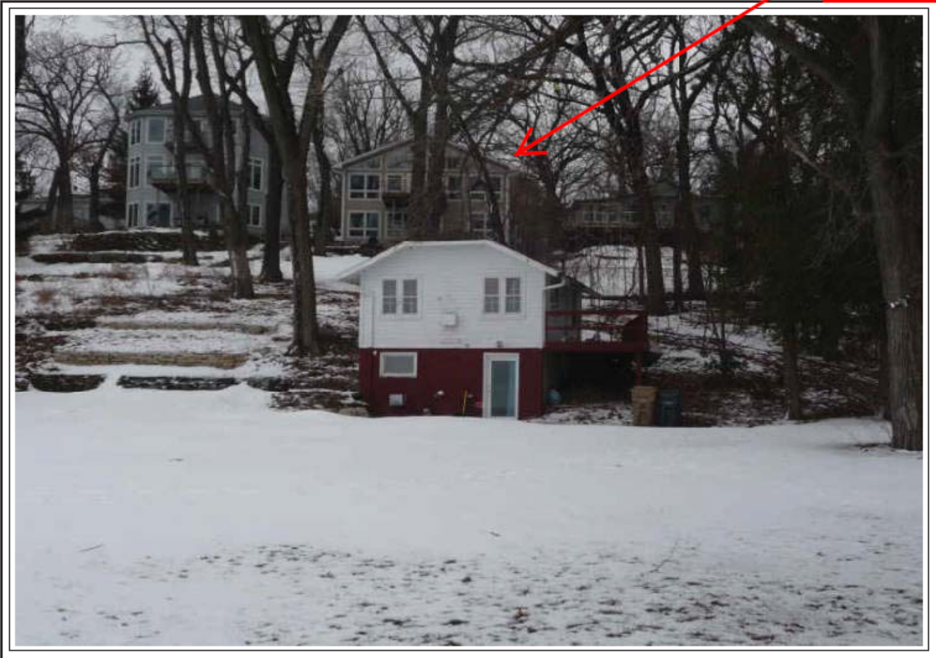
FRONT VIEW OF SUBJECT PROPERTY

Appraised Date: March 7, 2011 Appraised Value: $ 861,000