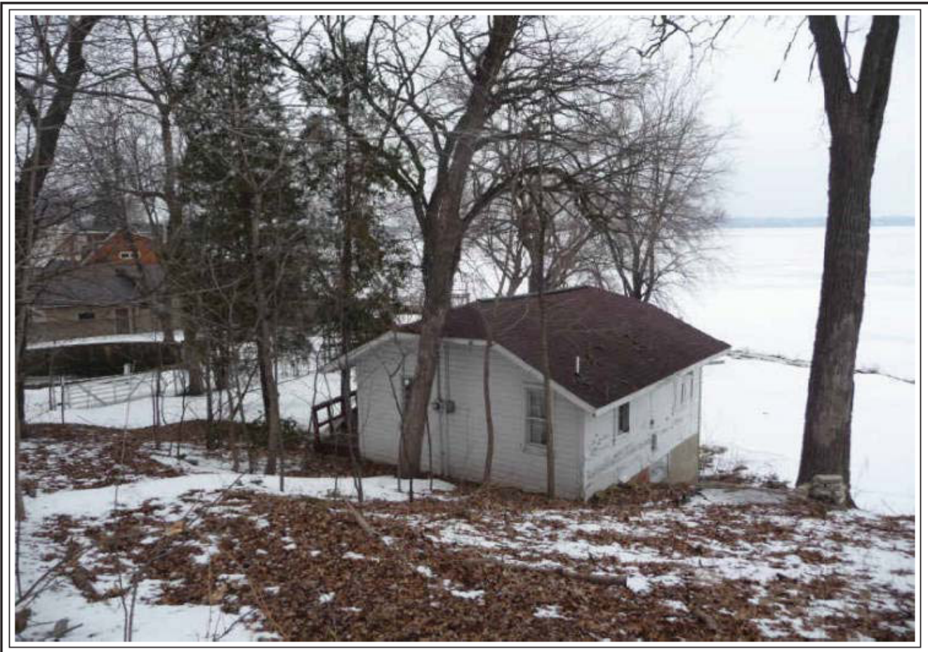
REAR VIEW OF SUBJECT PROPERTY

Appraised Date: March 7, 2011 Appraised Value: $ 861,000