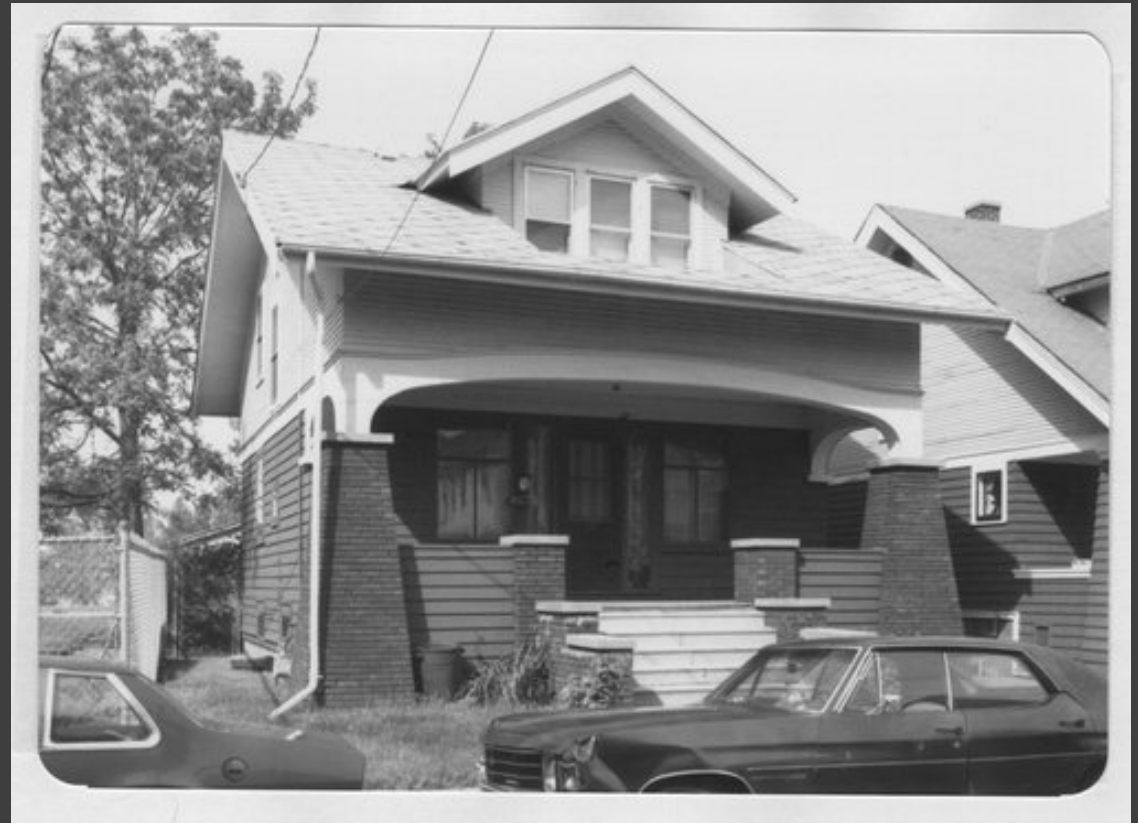
1984 survey photo