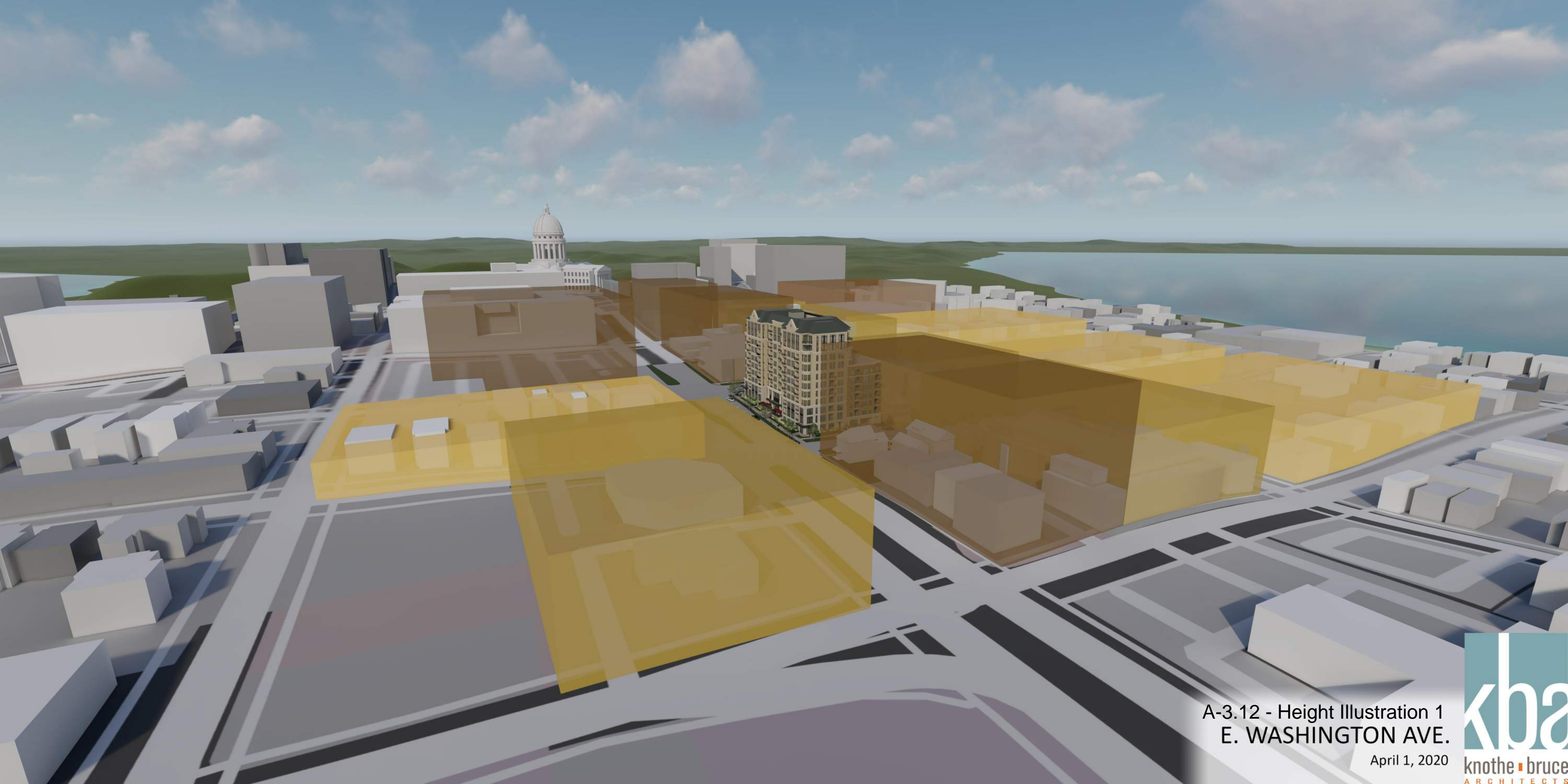
A-3.12 - Height Illustration 1 E. WASHINGTON AVE.