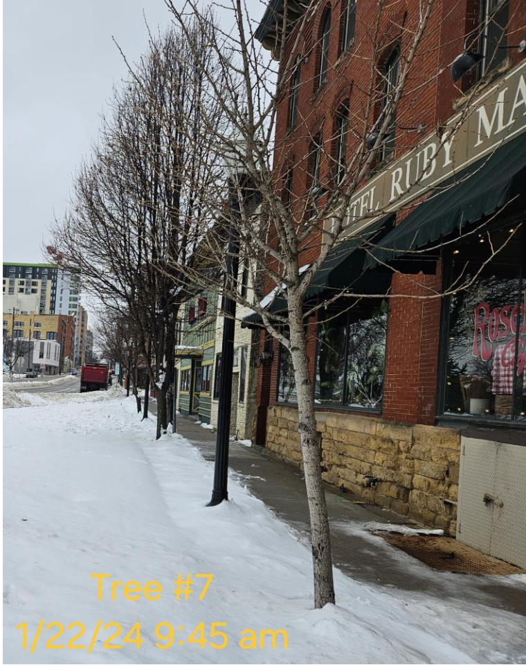
Tree #7 1/22/24 9:45 am