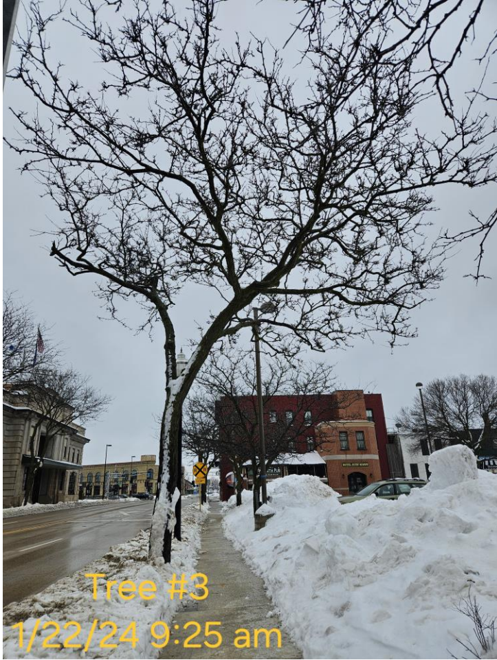
Tree #3 1/22/24 9:25 am