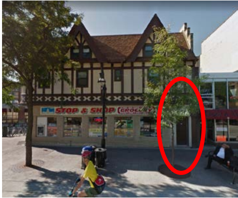
Louisville Alley Gallery Before