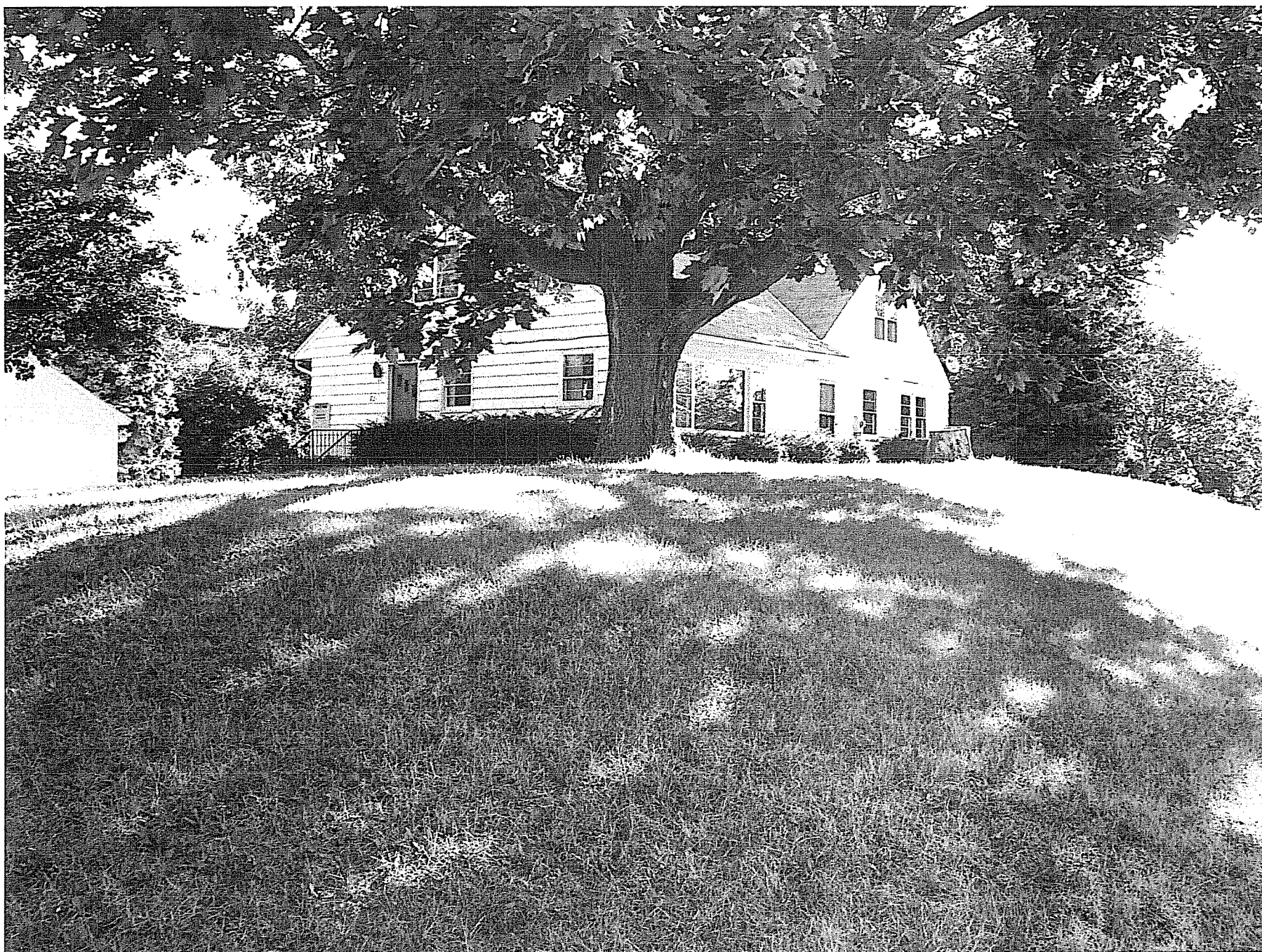
D from corner SW