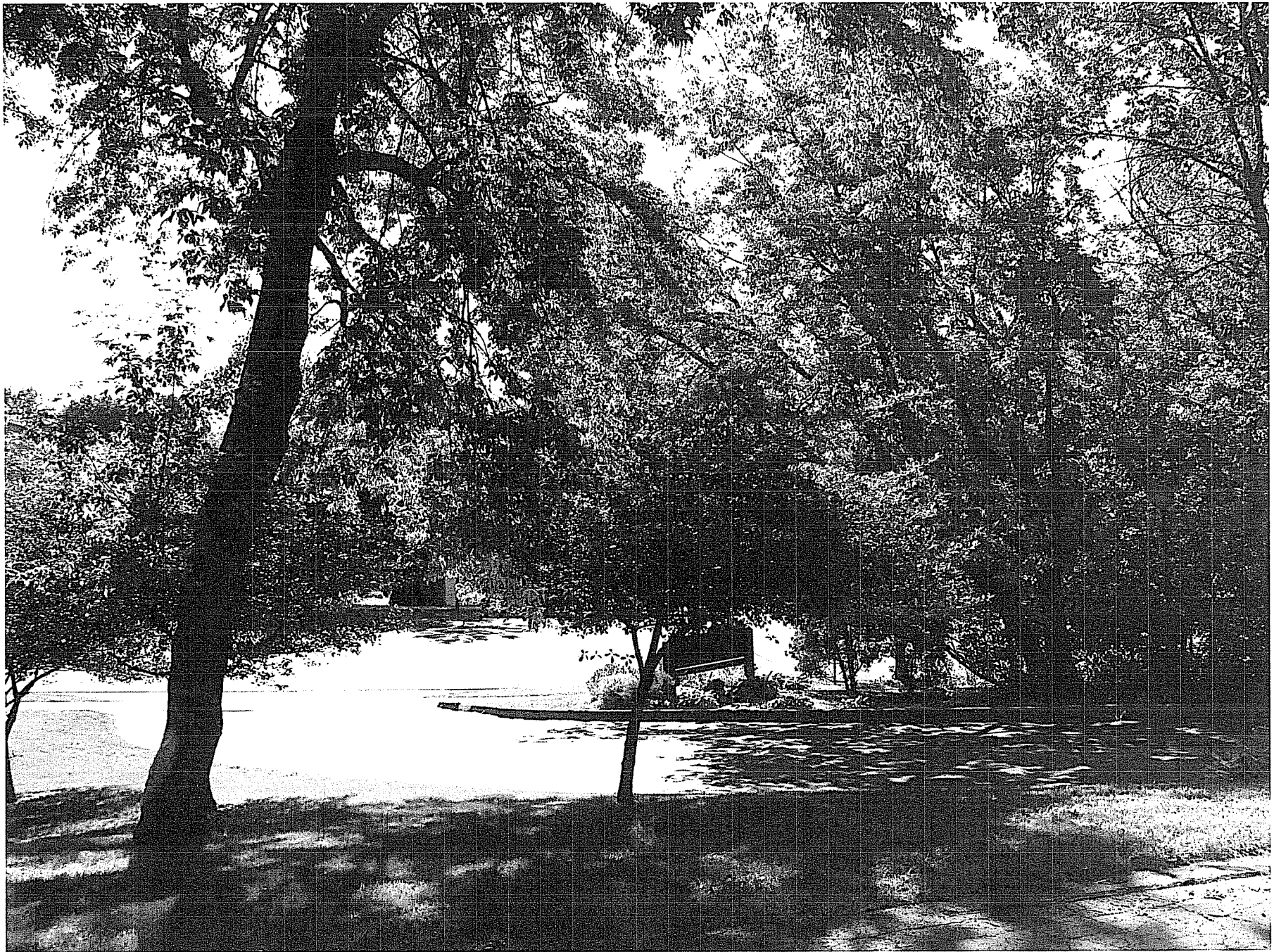
C Looking EAST from W. QUAYSON