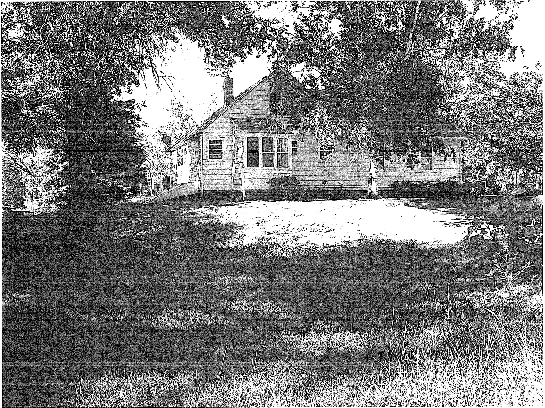
A from foot level, my terrace north