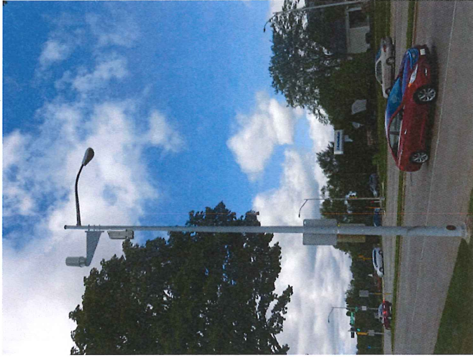
PHOTO SIMULATION OF POLE WITH NODE INSTALLED