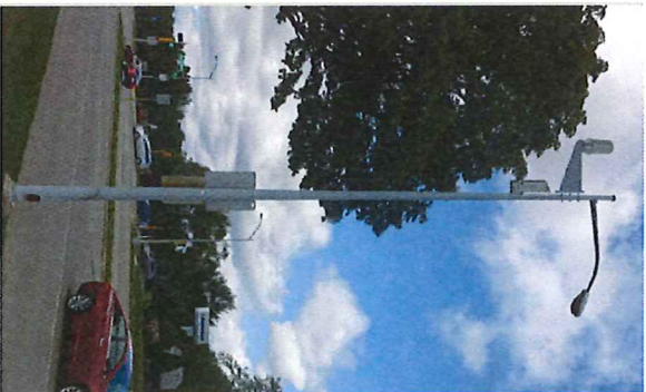
SITE LOCATION SIM PHOTO