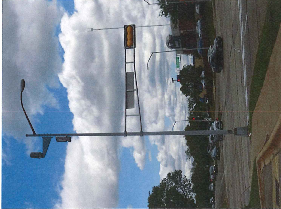
PHOTO SIMULATION OF POLE WITH NODE INSTALLED