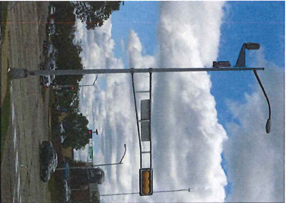
SITE LOCATION SIMI PHOTO