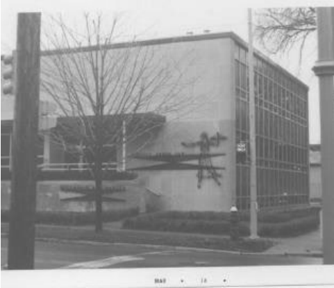
WHS Architecture and History Inventory #107380 (1974)