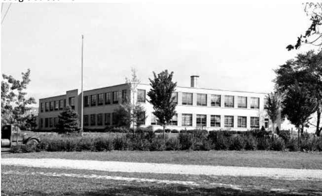
WHS Architecture and History Inventory #109633 (1954)