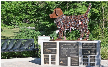
St. Charles, IL