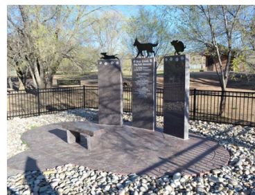
El Paso County, CO