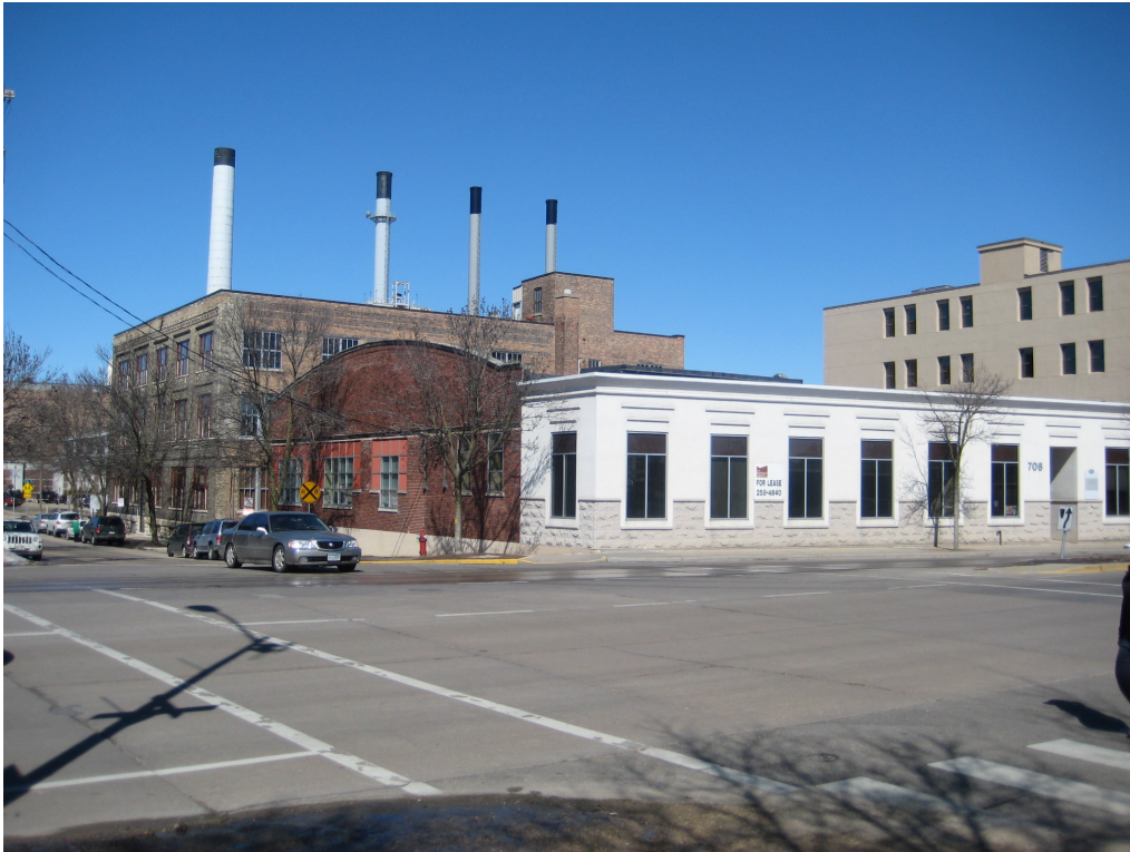
View of building from Williamson / Blount intersection looking north