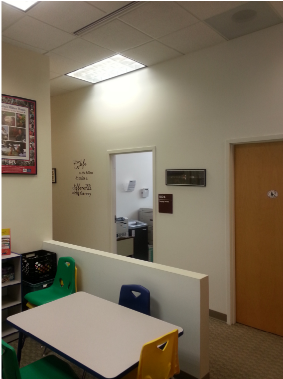
702 Williamson Street (interior photos)