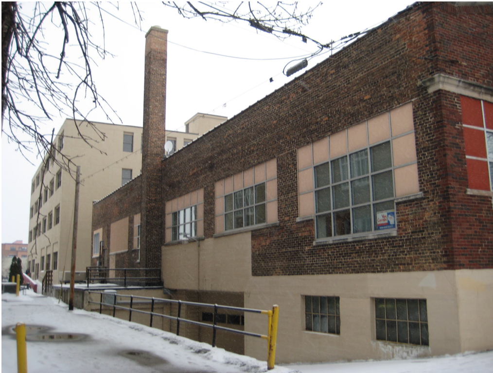
View at back of building looking east.