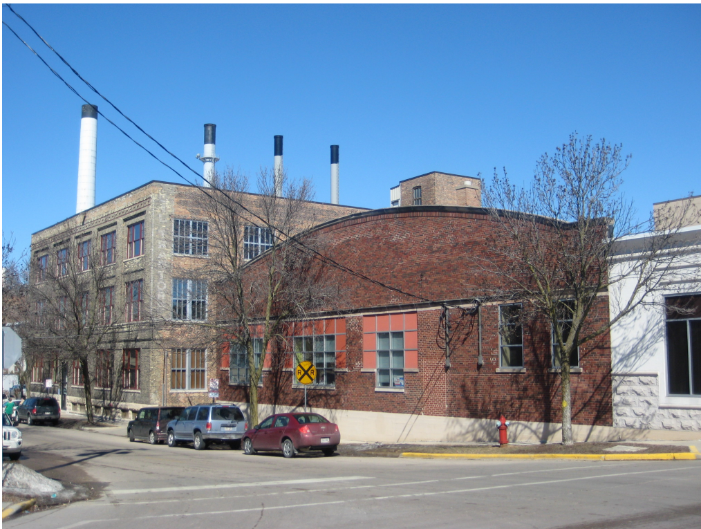
View of building from Williamson / Blount intersection looking north