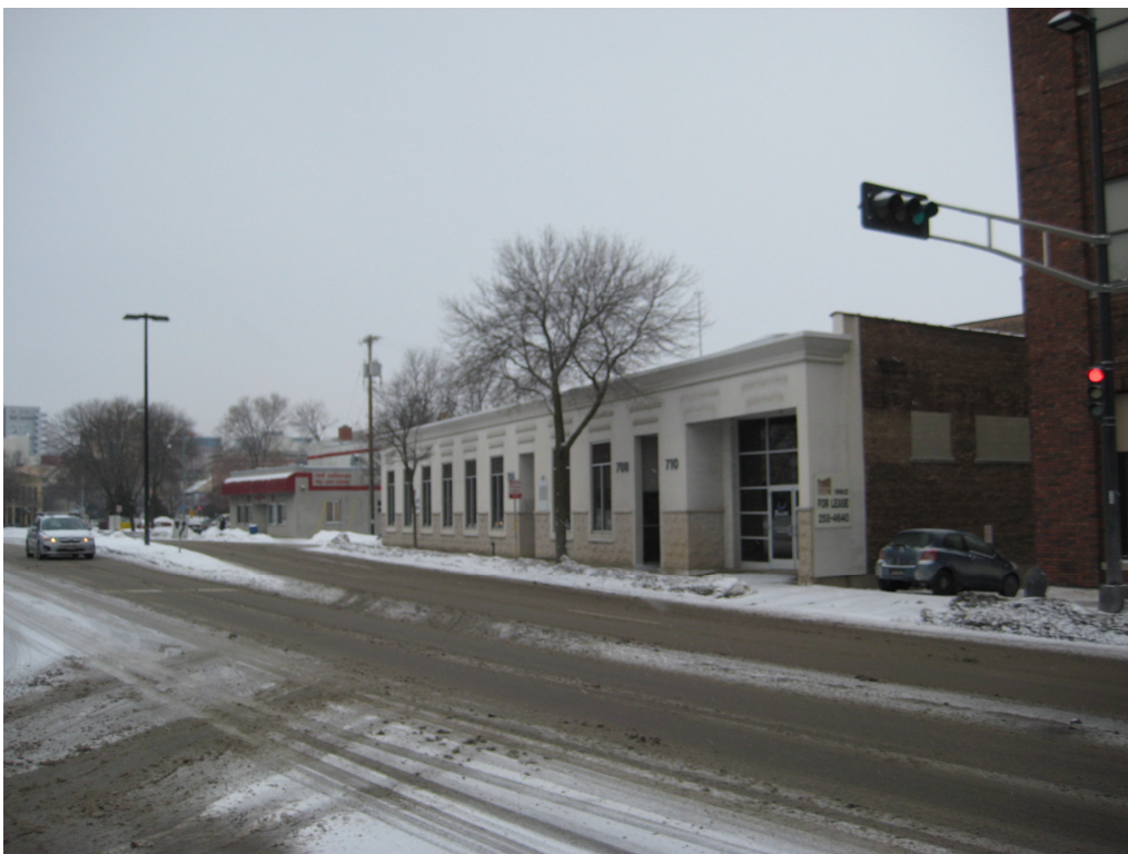
View of building from Williamson Street looking west