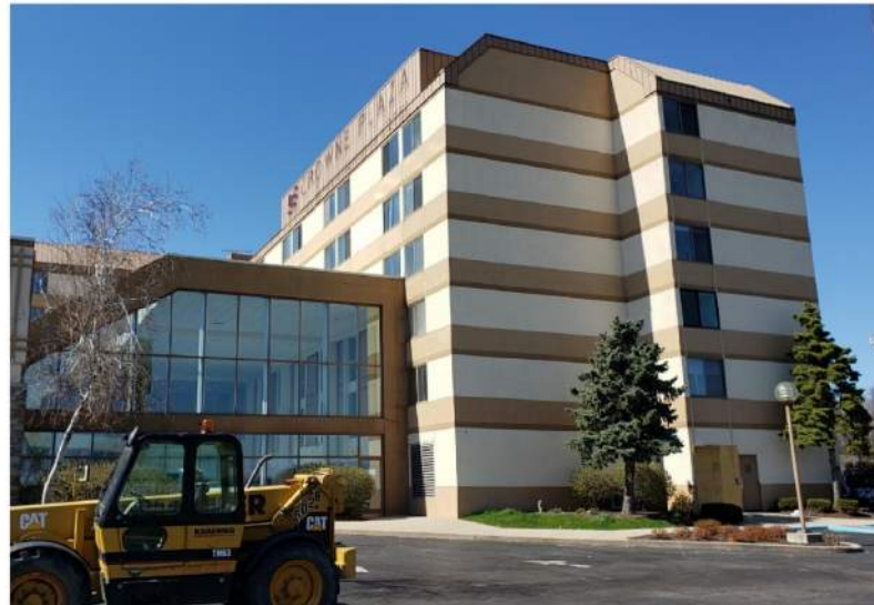
4402 East Washing ton Avenue – Exterior No. 6