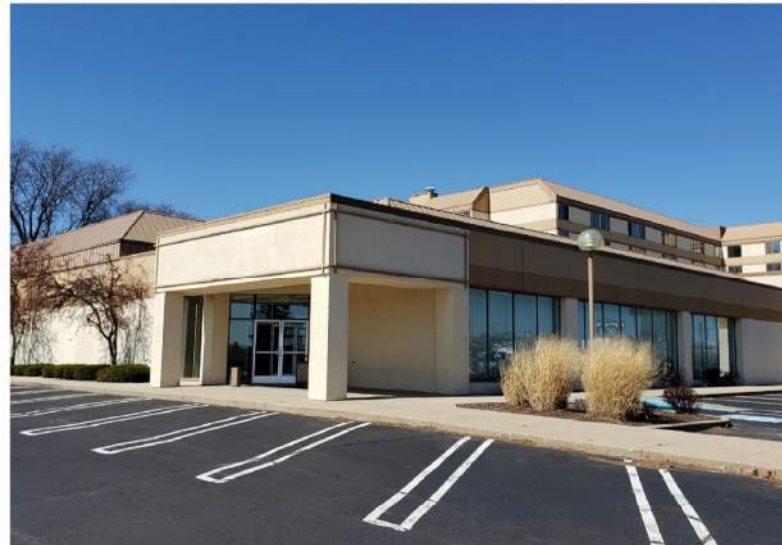
4402 East Washing ton Avenue – Exterior No. 5