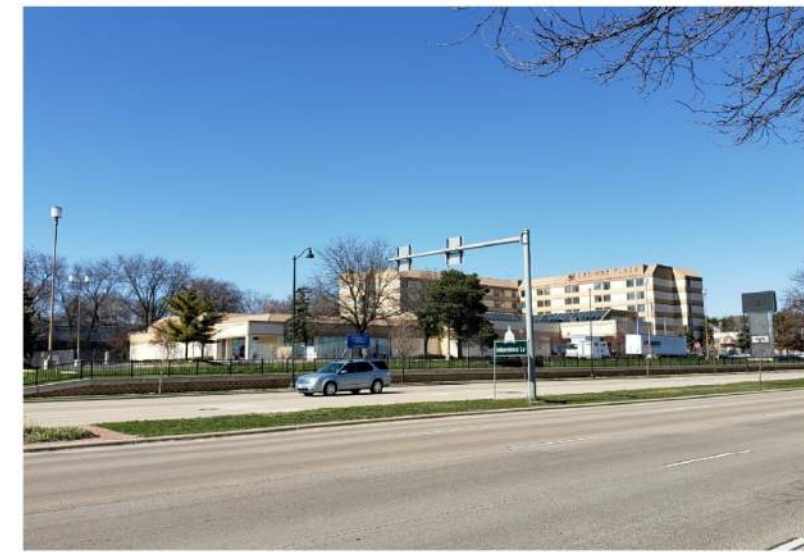
4402 East Washing ton Avenue – Exterior No. 7