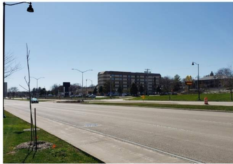
4402 East Washing ton Avenue – Exterior No. 8