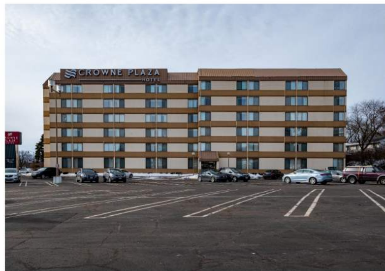
4402 East Washing ton Avenue – Exterior No. 2