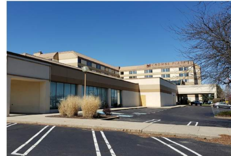
4402 East Washing ton Avenue – Exterior No. 4