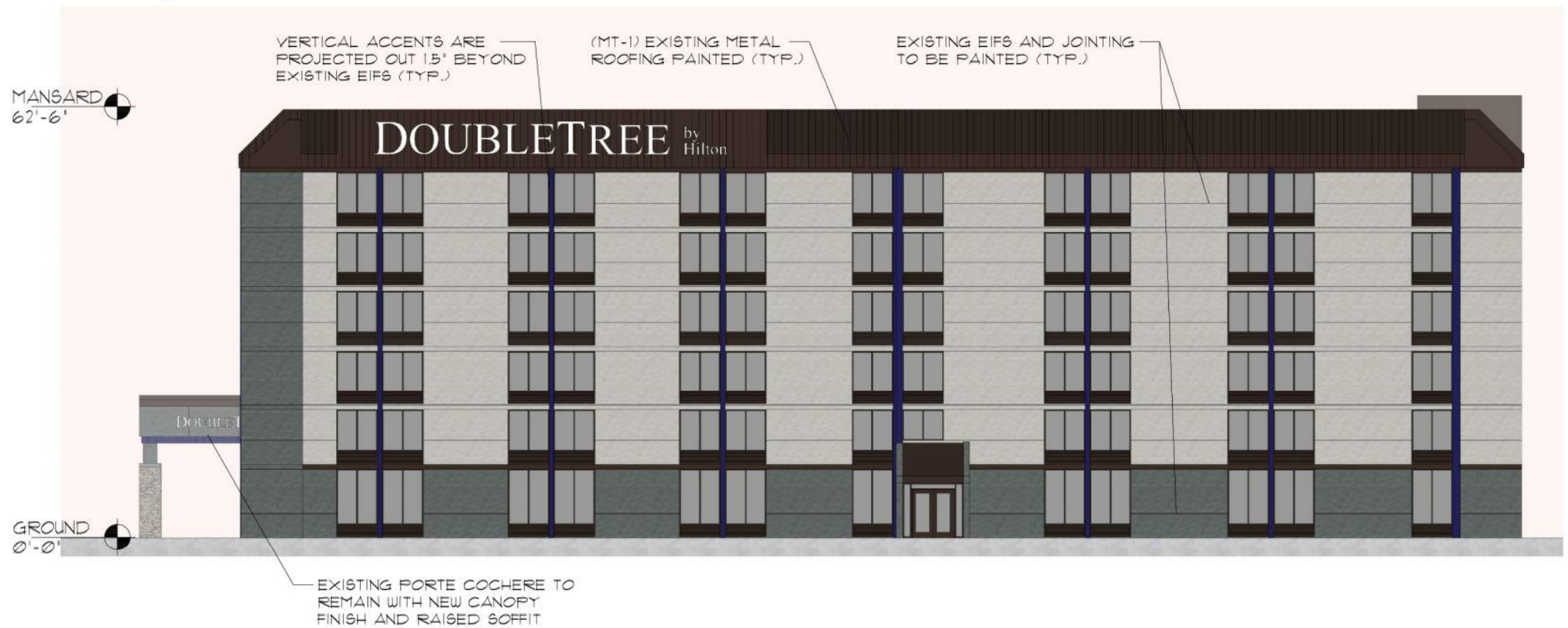
① NORTHEAST ELEVATION