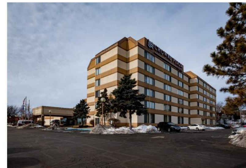
4402 East Washing ton Avenue – Exterior No. 1