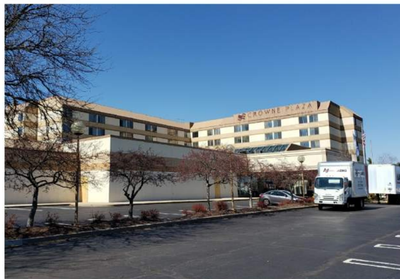
4402 East Washing ton Avenue – Exterior No. 3