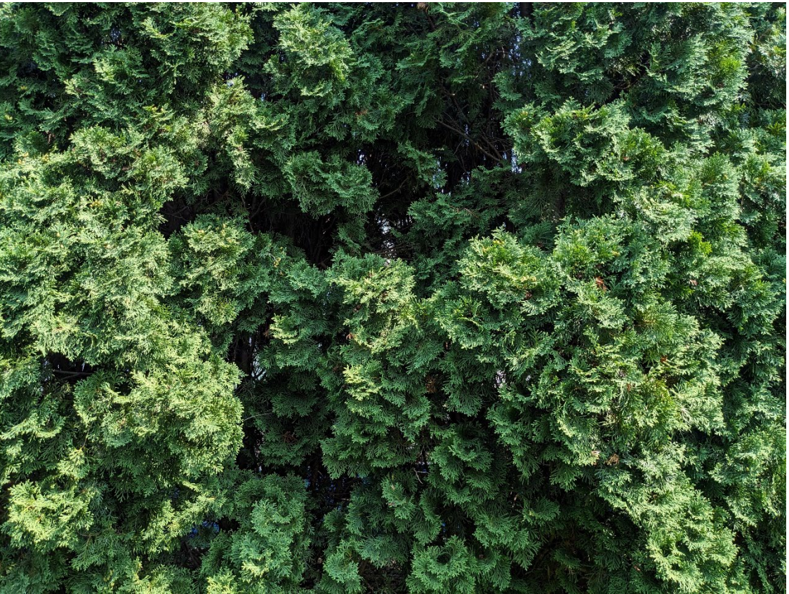
5 Vinje Ct