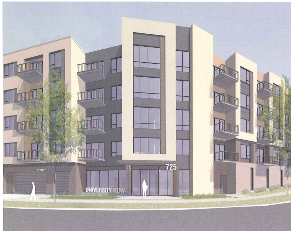
WEST RESIDENTIAL ENTRY