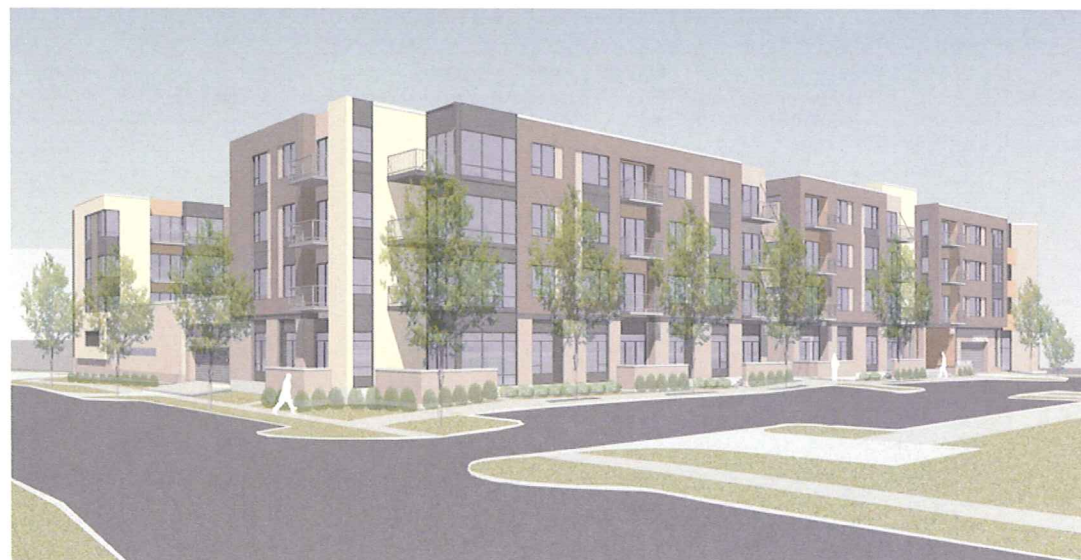
SOUTHEAST CORNER VIEW