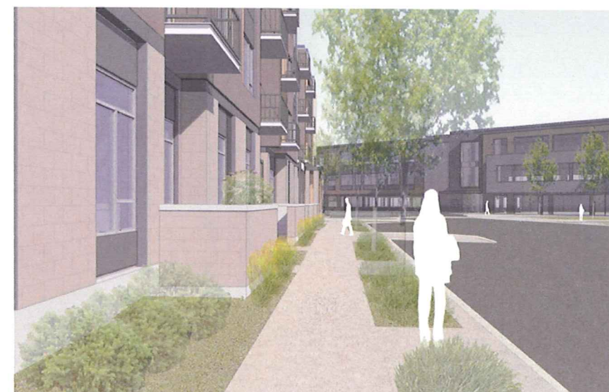
RESIDENTIAL STREET VIEW