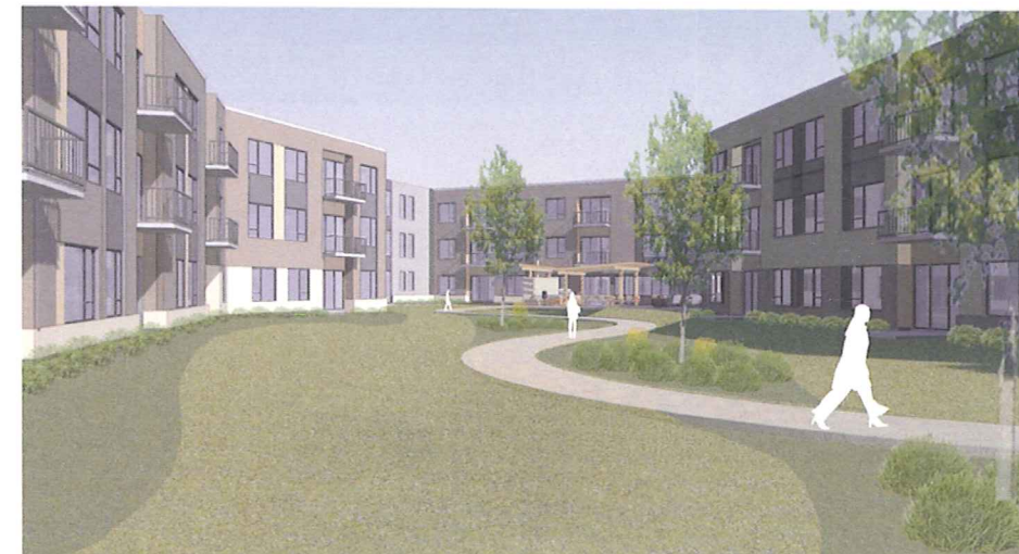
GREEN ROOF VIEW