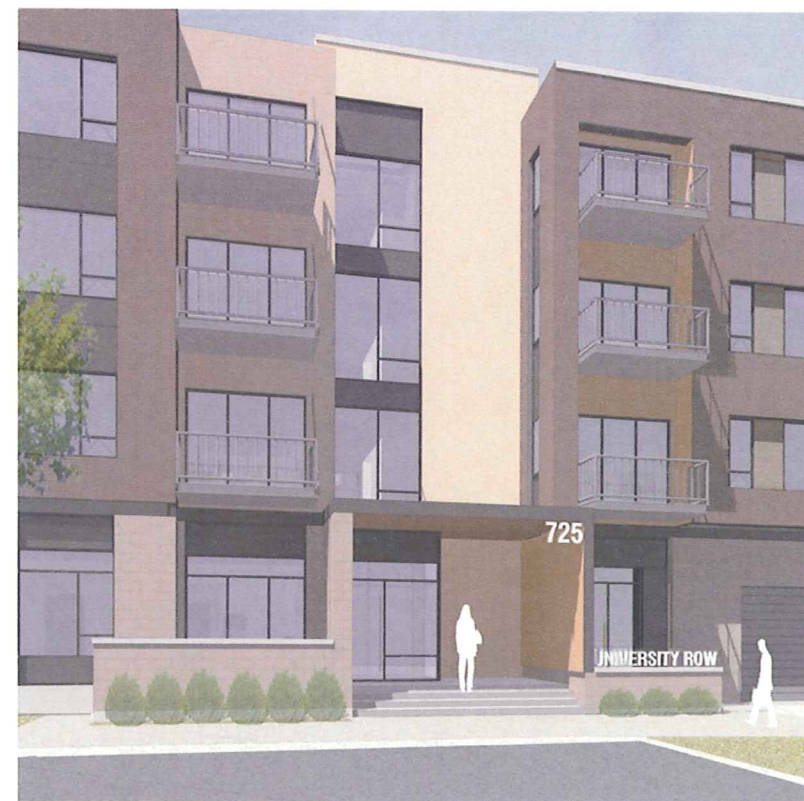
EAST RESIDENTIAL ENTRY