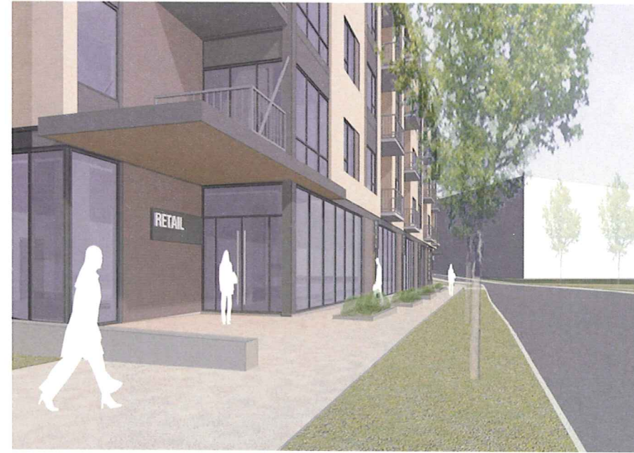
RETAIL STREET VIEW