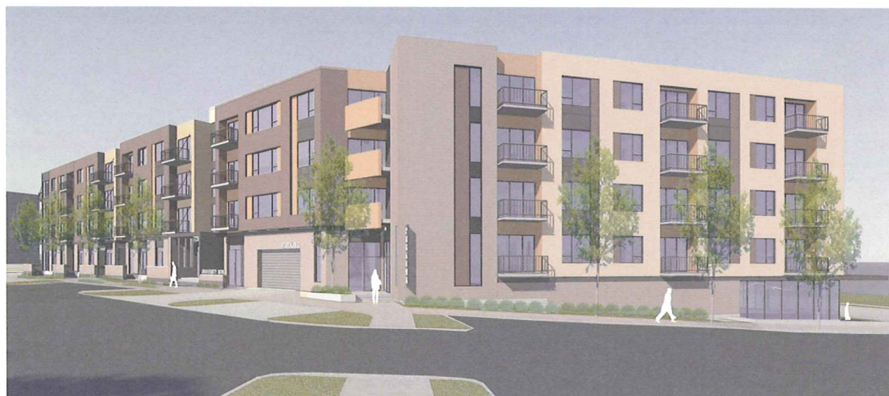
PARKING ENTRY FROM BUILDING FOUR